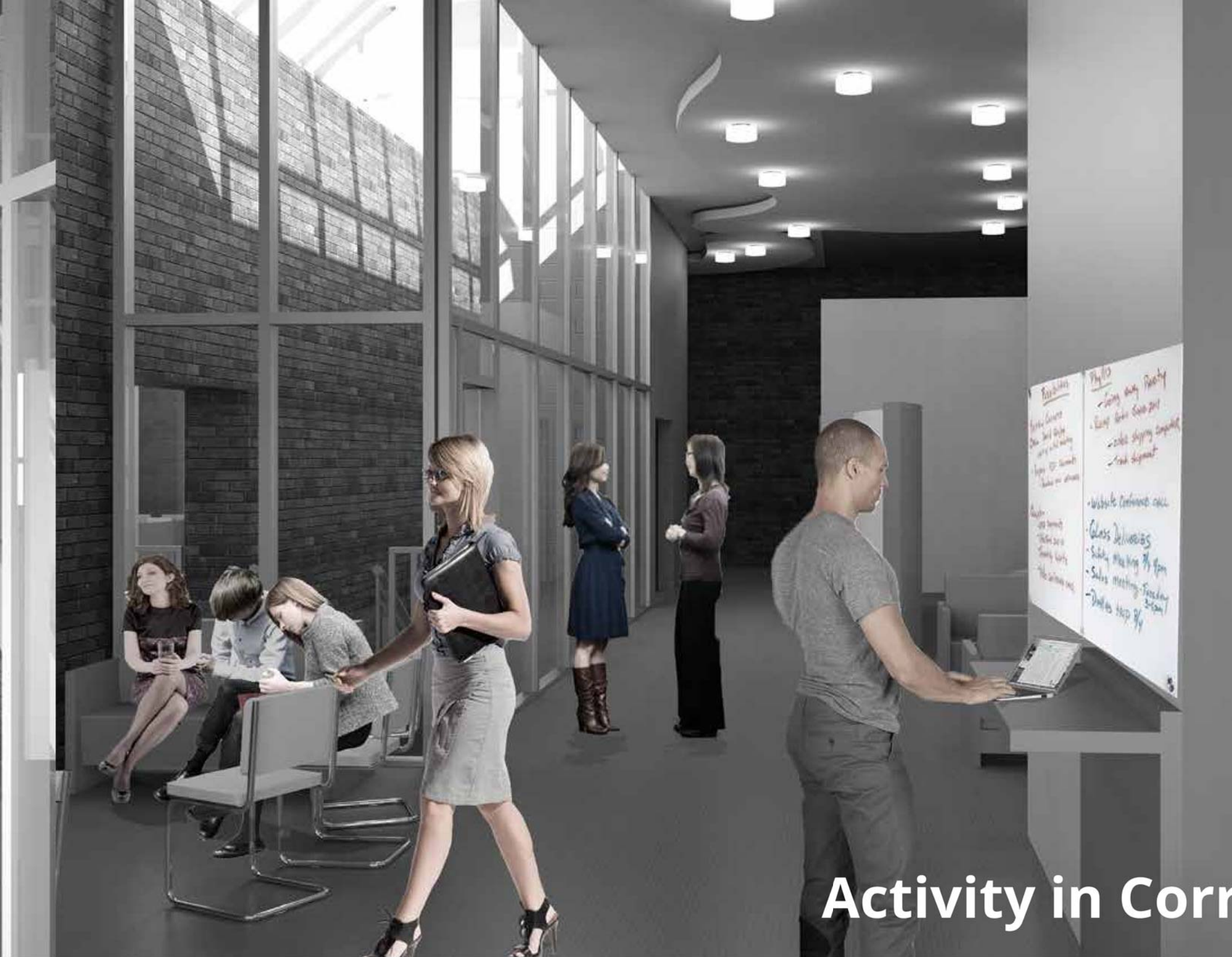
Activity in Corridor