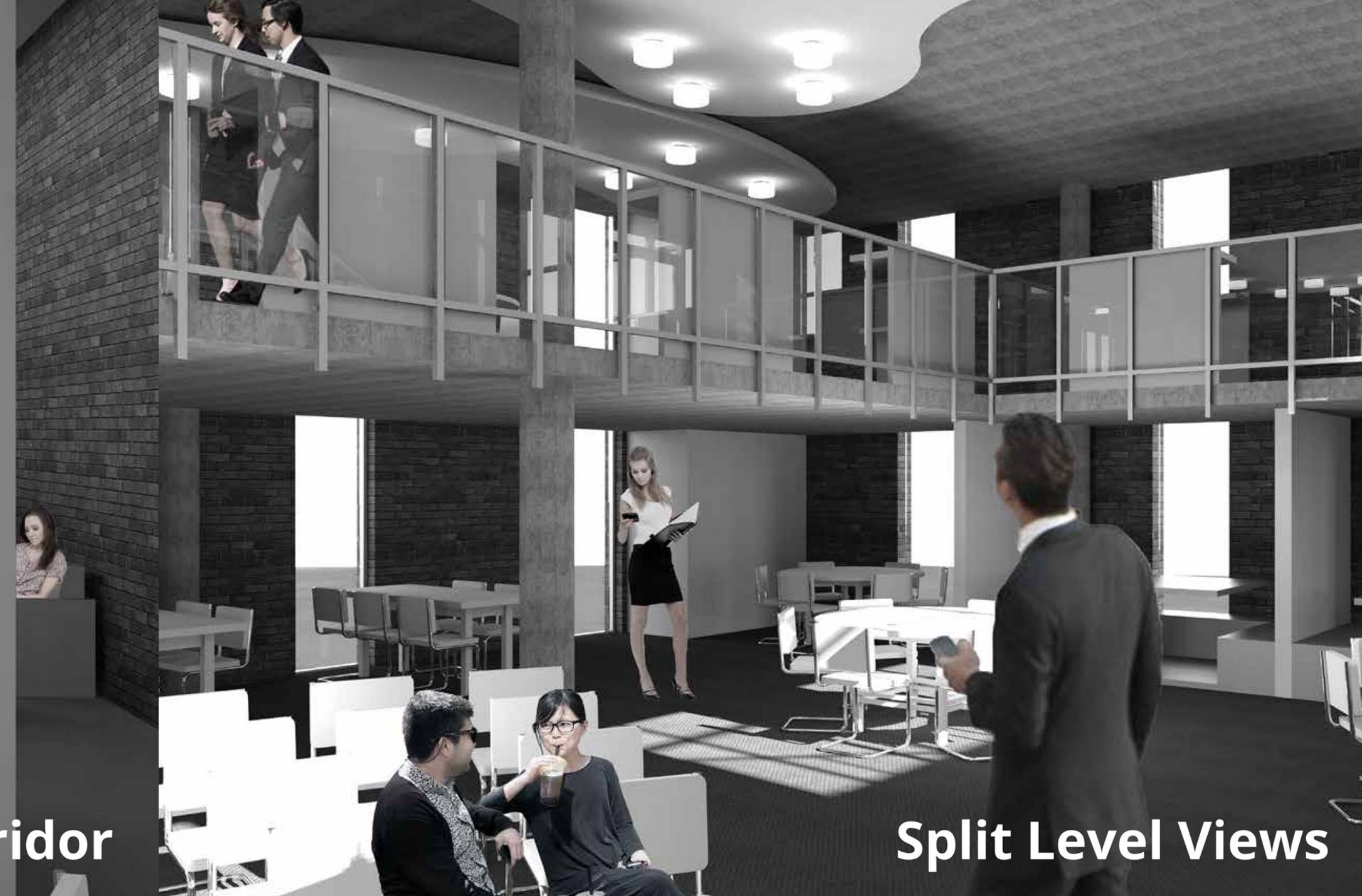
Split Level Views