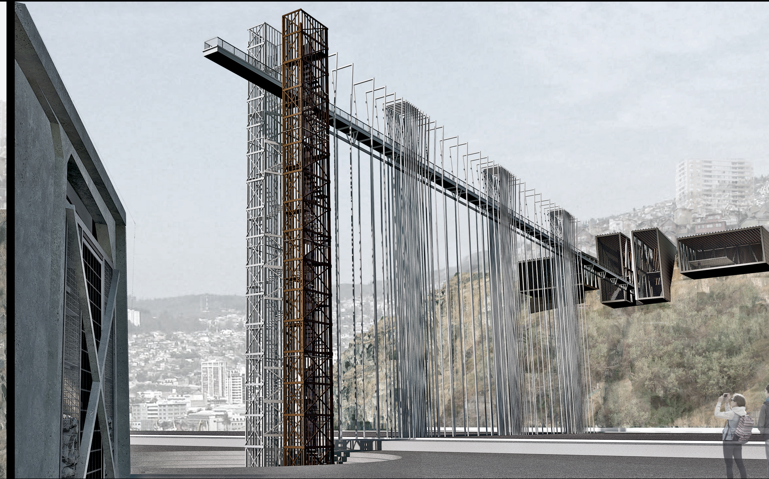
The bridge is a connection and extension of the community - from the land into the ocean and to the memorial museum. A precarious landmark for the city to memorialize earthquakes, embodying the tension between the two imposing elements of the site (the hills and the ocean).