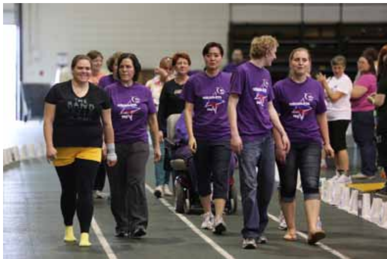
The Survivors' lap marked the start of the 12-hour relay

If you would like to join next year's Staff Senate Relay for Life team, we'd love to have you – just let us know and stay tuned for more details to come! Together we will make a difference!