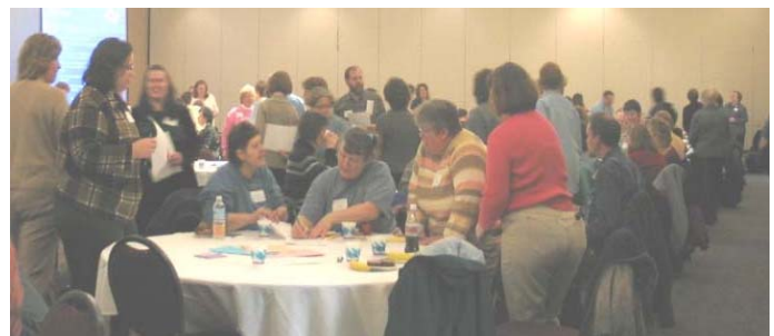
"Bison Bingo" participants open up seminar's activities