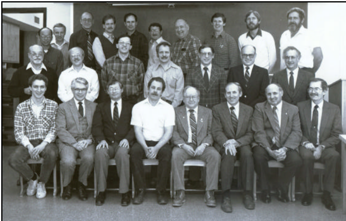
A Trip Down "Memory Lane" . . . Do you recognize any of these young folks from our department?