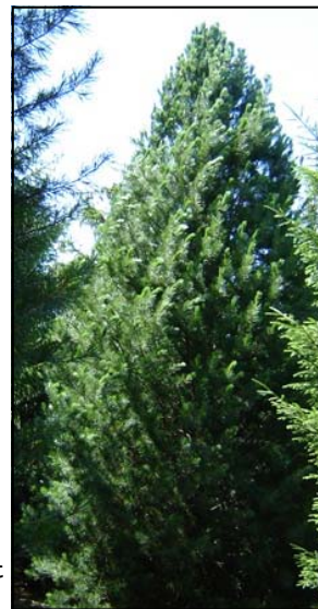
Prairie Statesman® Swiss Stone Pine - Pinus cembra 'Herman'

A Student Government Improvement Grant helped fund this project.