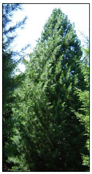
Prairie Statesman® Swiss Stone Pine - Pinus cembra 'Herman'

A Student Government Improvement Grant helped fund this project.