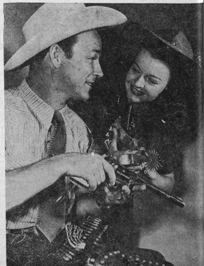
The famous cowboy star, Roy Rogers and his lovely wife, Dale Evans, known to the film world as "Queen of the West" check Rogers' six-shooter and spur to be ready for their personal appearance here for one day only. They will head a great cast of singers and dancers in a big Western Variety Show.

Prices for the performances are matinee: general admission 75c reserved seats $2-3, evening: general admission $1, reserved seats $2-3. All prices include tax.