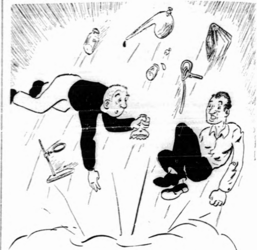
"Guess that wasn't the right formula for phosphorus pentoxide."