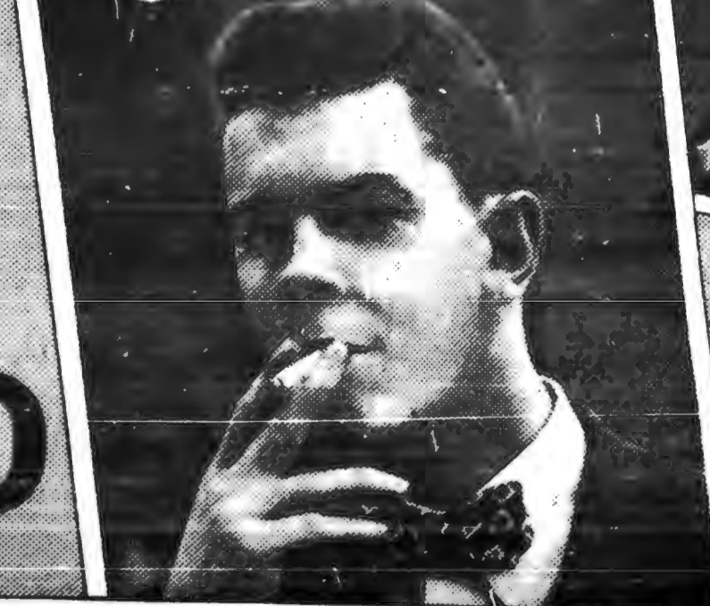
PHOTOGRAPHS TAKEN ON CAMPS