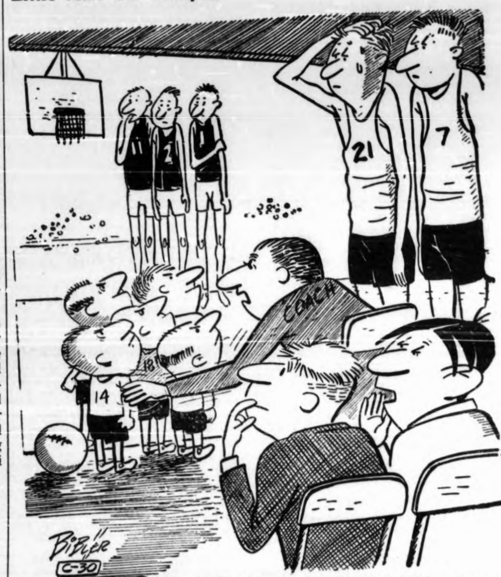
"Don't worry—the coach knows what he's doin'! Height may prove to be a disadvantage."