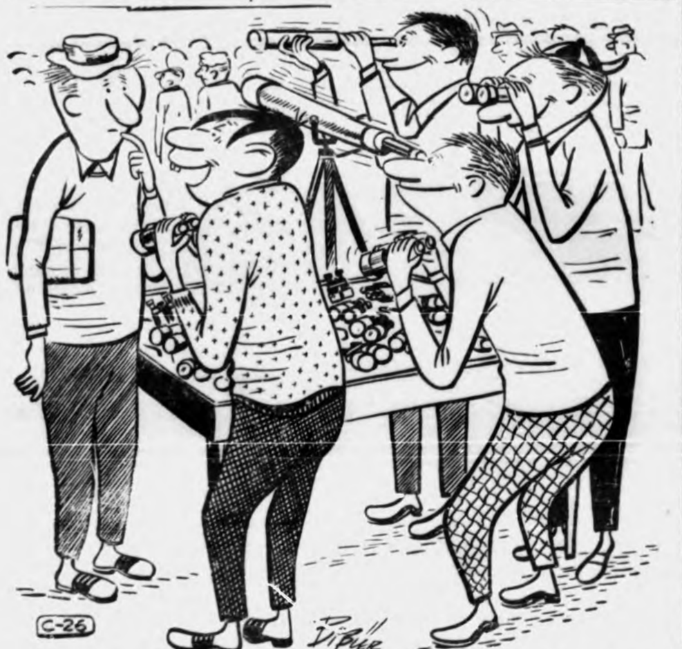
You know that new fraternity house they built next door?—It's a SORORITY!!

We doubt the claim that it is impossible to provide constructive work for 70-100 scums for a week in this community. With several months of advance planning the IF council would find it quite possible to organize a legitimate Help Week. And if NDAC fraternity men will back the plans of the council 100% Hell Week can be abolished instead of masquerading under a new name. One letter doesn't after all, make a hell-of-a-difference.