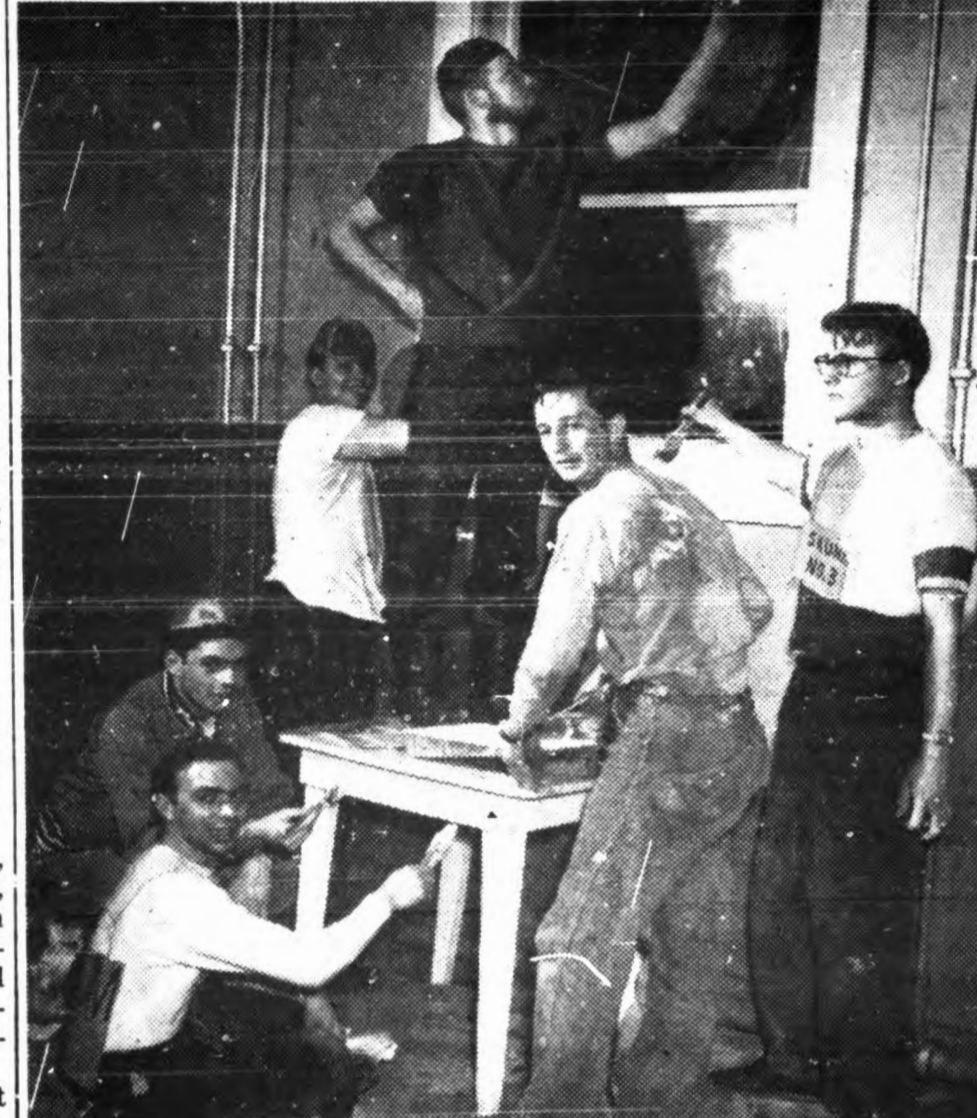
Fraternity pledges paint in a children's home as part of Help Week activities. Help Week was sponsored by the Interfraternity Council.