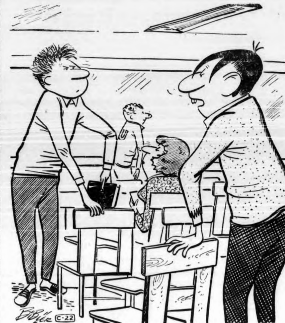
"Betcha ole Prof. Snarf popped a rough quiz in here last period—this room smells like the boy's gymnasium."