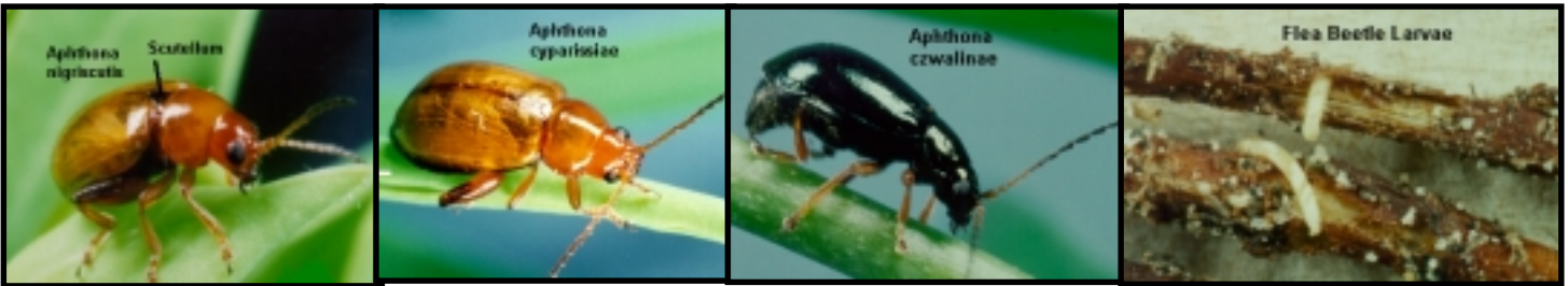
Figure 1 a, b, c, d

Six flea beetle species have been introduced into North Dakota for the biological control of leafy spurge. Aphthona nigriscutis and A. lacertosa have been the most successful to date in developing high populations and reducing leafy spurge densities while A. cyparissiae has been successful to a lesser degree. A. czwalinae , A. flava and A. abdominalis have generally not shown the impressive results of the former species to date and are not discussed in detail in this publication.