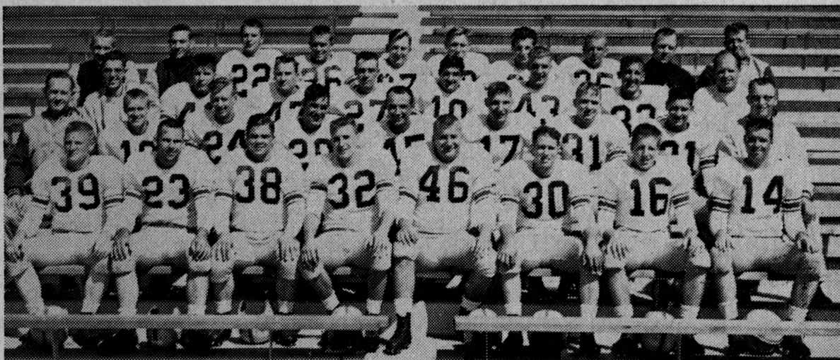
Pictured above are this year's entry in the North Central conference football derby from North Dakota State. Hampered by lack of numbers and injuries, the Herd may not sweep to the title this year; but the tremendous spirit that they show promises much for the future.