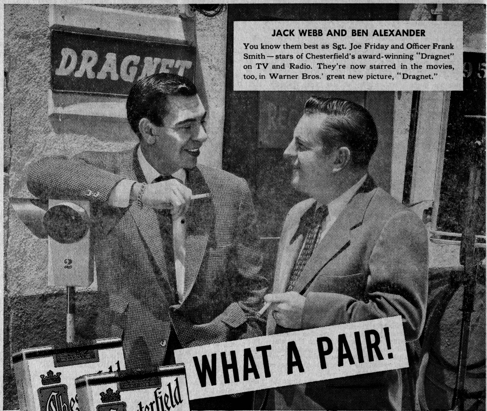
JACK WEBB AND BEN ALEXANDER You know them best as Sgt. Joe Friday and Officer Frank Smith — stars of Chesterfield's award-winning "Dragnet" on TV and Radio. They're now starred in the movies, too, in Warner Bros.' great new picture, "Dragnet."

Applications will be accepted by the Board of U. S. Civil Service Examiners, Department of Agriculture, Washington 25, D. C., until further notice.