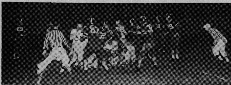
The thundering Herd gives the Morningside line some work to do in last week's NCC encounter.

In the line the Bison were on fire. Paced by the aggressive of-