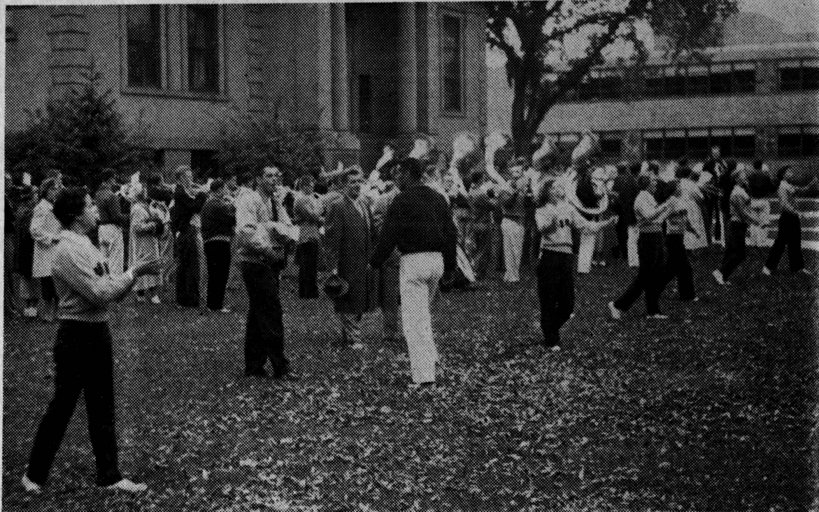
Leading a cheer at the pep convo held last Friday noon are the NDSC cheerleaders. With the band and football team in attendance, the pep convo attracted a large crowd.

Future plans call for a pep convo before each home game played by the Bison. These events are sponsored by the Rahjahs, NDSC pep club.