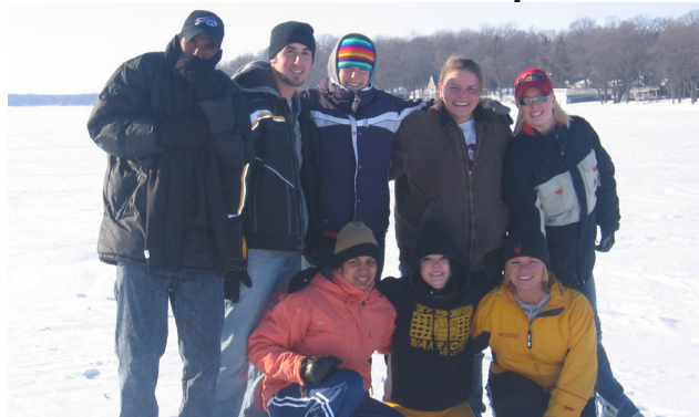
Last winter's Kujenga participants

Faculty and staff are invited to nominate current NDSU students to participate in Kujenga, a leadership-training program aimed at helping students develop intercultural connections and an increased diversity awareness. The overall intent is that the students' experiences will lead to a more inclusive and valuable experience for others at NDSU.