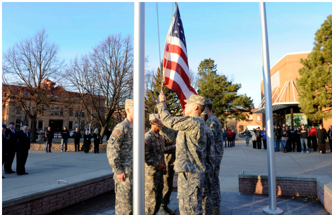
Army ROTC color guard members raise the flag outside the Memorial Union during a ceremony on Veterans Day.

NDSU held a flag-raising ceremony in honor of Veterans Day on Nov. 10 at 8:05 a.m. outside the south entrance of the Memorial Union. Veterans Day was Friday, Nov. 11, the anniversary of the armistice that ended World War I in 1918.