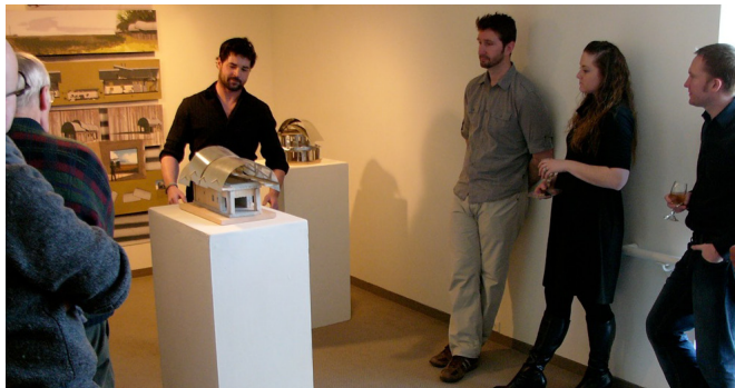
NDSU architecture students display their design proposals for the North Dakota Museum of Art's new residence live-in-studios.

Third-year architecture students will display sketches and models at the North Dakota Museum of Art in Grand Forks, N.D., through March 20. The exhibit is titled "McCanna House Studies: Explorations of Studios and Living Spaces by NDSU Architecture Students."