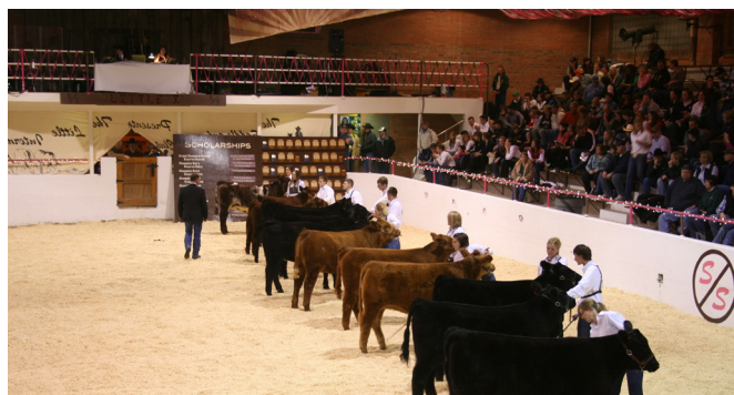
Students showing livestock during Little International