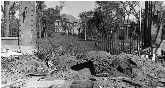
The Campus Gates, erected in 1912 through the efforts of the Class of 1912, were damaged by the tornado of June 20, 1957.

The NDSU University Archives has posted online a collection of 24 photographs recalling the devastating tornado that struck Fargo in 1957. The black and white photos show the destruction on the NDSU campus in the wake of the twister. The collection can be viewed at www.flickr.com/photos/ndsu-university-archives/collections/72157629673977587 .