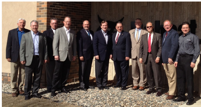
Representatives from NDSU, the NDSU Research and Technology Park, Bobcat and North Dakota State College of Science stand in front of the Bobcat facility in Gwinner, N.D.