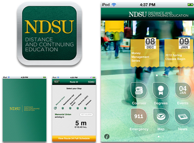
Screen shots of NDSU Distance and Continuing Education's new education mobile application

NDSU Distance and Continuing Education's recently released mobile application won a 2012 Gold ADDY Award in the mobile apps category at the annual American Advertising Federation of North Dakota awards banquet held Feb. 24.