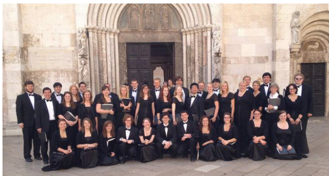
The NDSU Concert Choir took first place in a competition in Croatia during its tour of Europe.