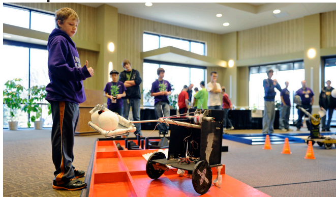
A student showcases his robot during last year's competition.

Middle and high school students from throughout the region will soon converge in Fargo to determine whose robot is best. NDSU is scheduled to host the Northern Plains BEST Robotics regional competition Dec. 6-8 at the Fargo Civic Center.