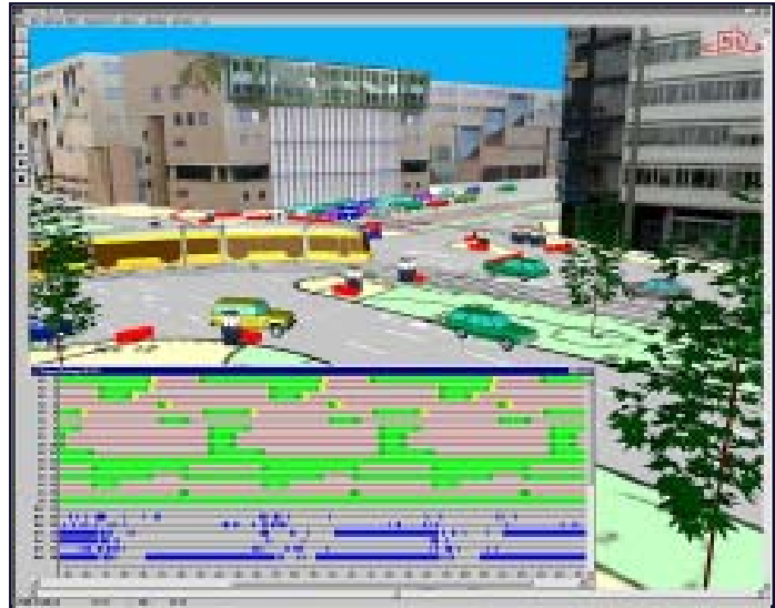
VISSIM simulation software models complex transportation systems.

One of the main components of a traffic simulation model is the network which includes roadway characteristics and the traffic control devices (traffic sig-