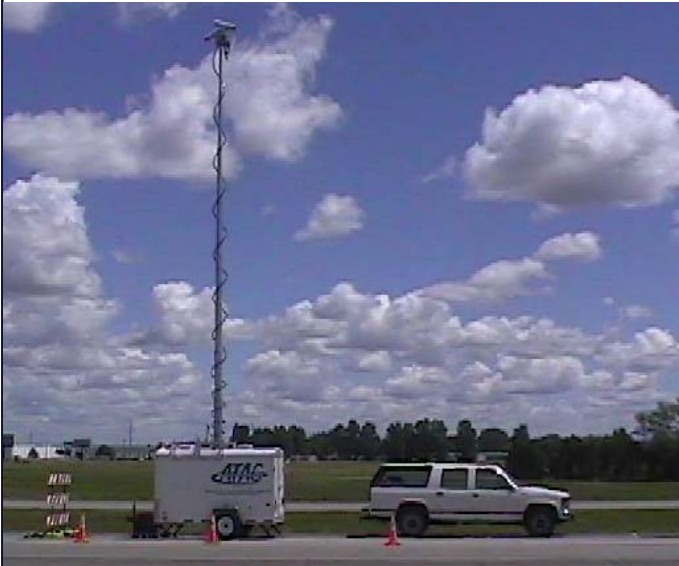
ATAC's Traffic Data Collection System features video detection.