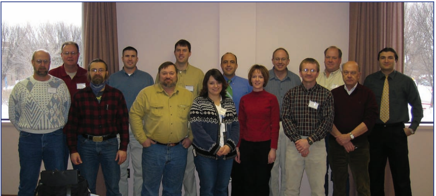
North Dakota Traffic Operations Roundtable Kickoff Meeting, January 2005, North Dakota State University

Currently, the roundtable group consists of 23 members from nine cities, FHWA ND Division, NDDOT, and MnDOT. The next meeting for the group is planned for September in Minot, North Dakota.