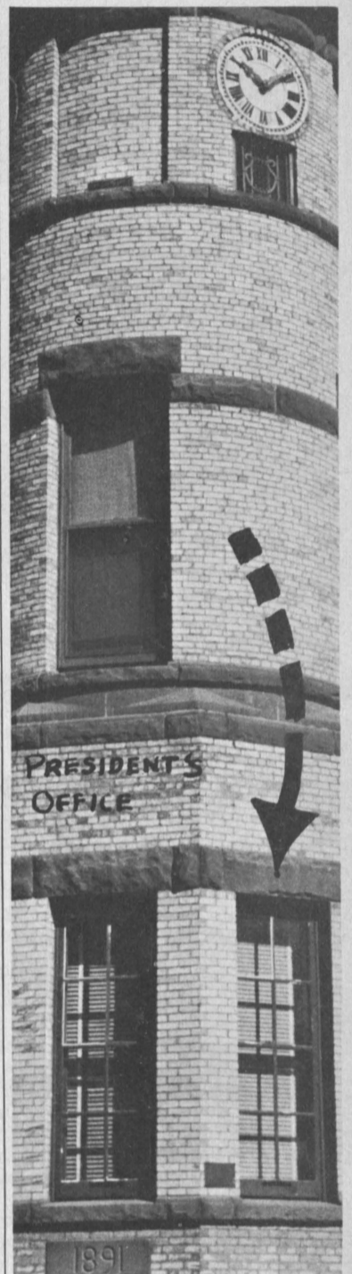
Administration officials barricaded themselves in Old Main during violent demonstrations over the razing of the White Castle.

An alumni from Penn State, according to informed sources, has provided a grant for reconstruction. The $9,000 gift will cover expenses incurred by the group of amateur archeologists who will undertake reconstruction of the deposed dormitory sometime this month. A spokesman for the group said that approximately 100 enthusiasts will begin their excavations in the University dump grounds this week. He said hopes