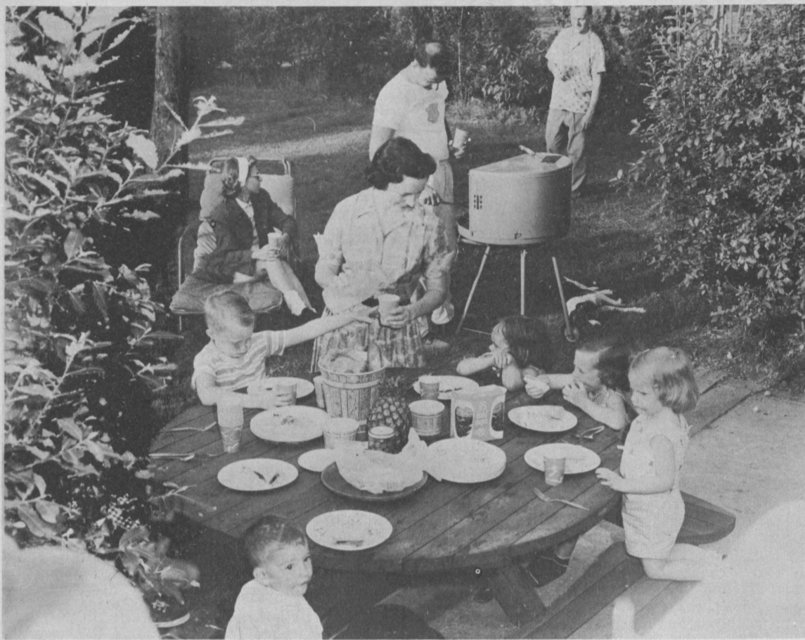
North Dakota State University Greeks celebrated their year's accomplishments by holding their annual Greek Week picnic recently. Events of the day included "Pin the tail on the Independent," and other fun games. In addition, Contract Feeding was practiced as all in attendance were required to chug-er, uh, - consume a specified amount of food under penalty of having to pay for what they couldn't eat.