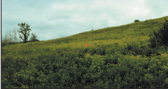
BEFORE/1992 Valley City, N.D.