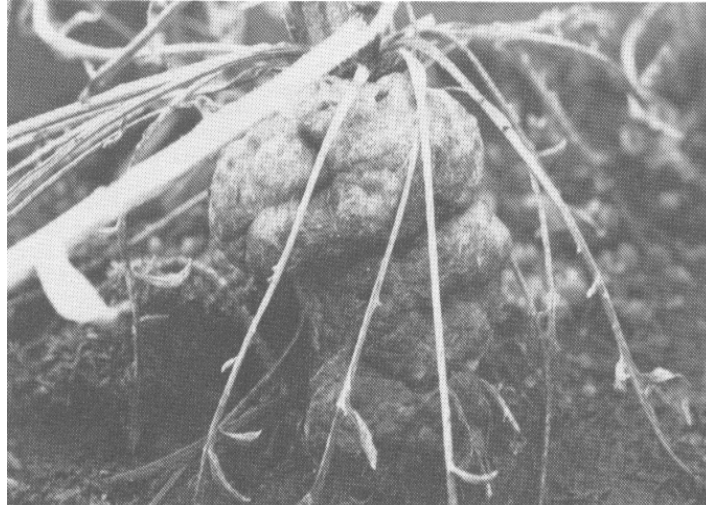
Fig. 1. Crown gall on diffuse knapweed ( Centaurea diffusa ) 3 weeks after inoculation with Agrobacterium tumefaciens strain AG83A. (Approximately 2X).