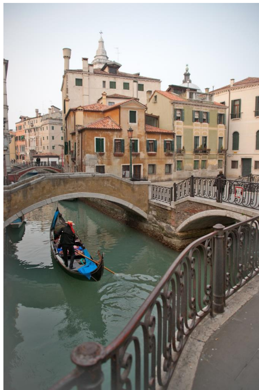
Figure 2. Photograph titled "Campo Santa Maria Formosa" ; shows a modern-day view of the Santa Maria Formosa bridges where Reynaldo Hahn's Venezia was premiered.

According to Henri de Régnier (1864-1936), a French poet in attendance that night, the performance took place under the arch of a bridge of Campo Santa Maria Formosa (see fig. 2). He described Hahn's voice as "precise and flexible, indolent and nervous . . . filled with tender charm and grace of fine Venetian words." 68