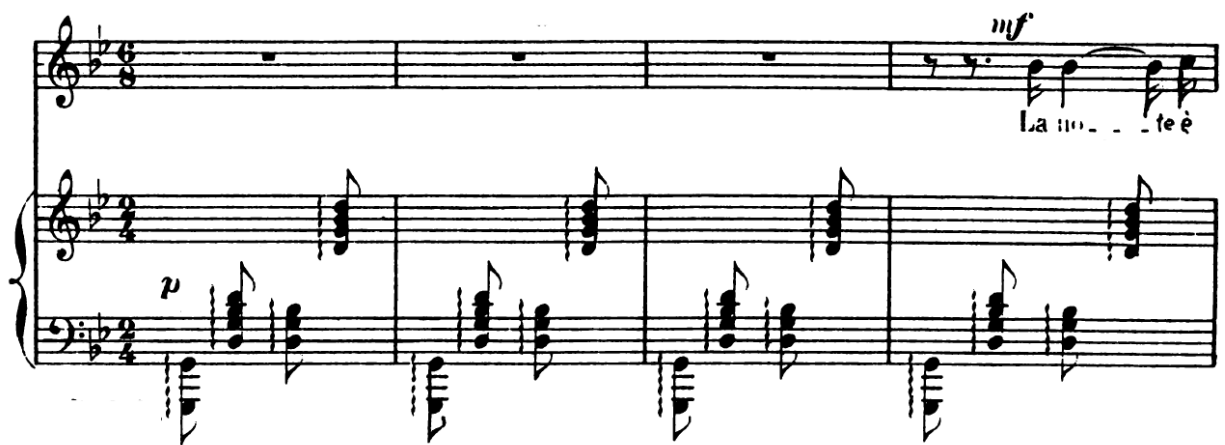
Example 3. Mm 1-4 “La Barcheta.”

“La Barcheta” is the only song in Venezia that does not have a dedication. It is stylistically similar to the previous song and opens with an ostinato rhythmic pattern that remains constant throughout the piece. The suggested use of pedal and arpeggiated chords in the piano create a seductive mood (example 3). Hahn marks the tempo of this song as “Andantino con moto, ma languido” (a little faster than Andante with motion, but languid). This texture, combined with the rocking feeling of duple time, creates a watery atmosphere for “the little boat.”