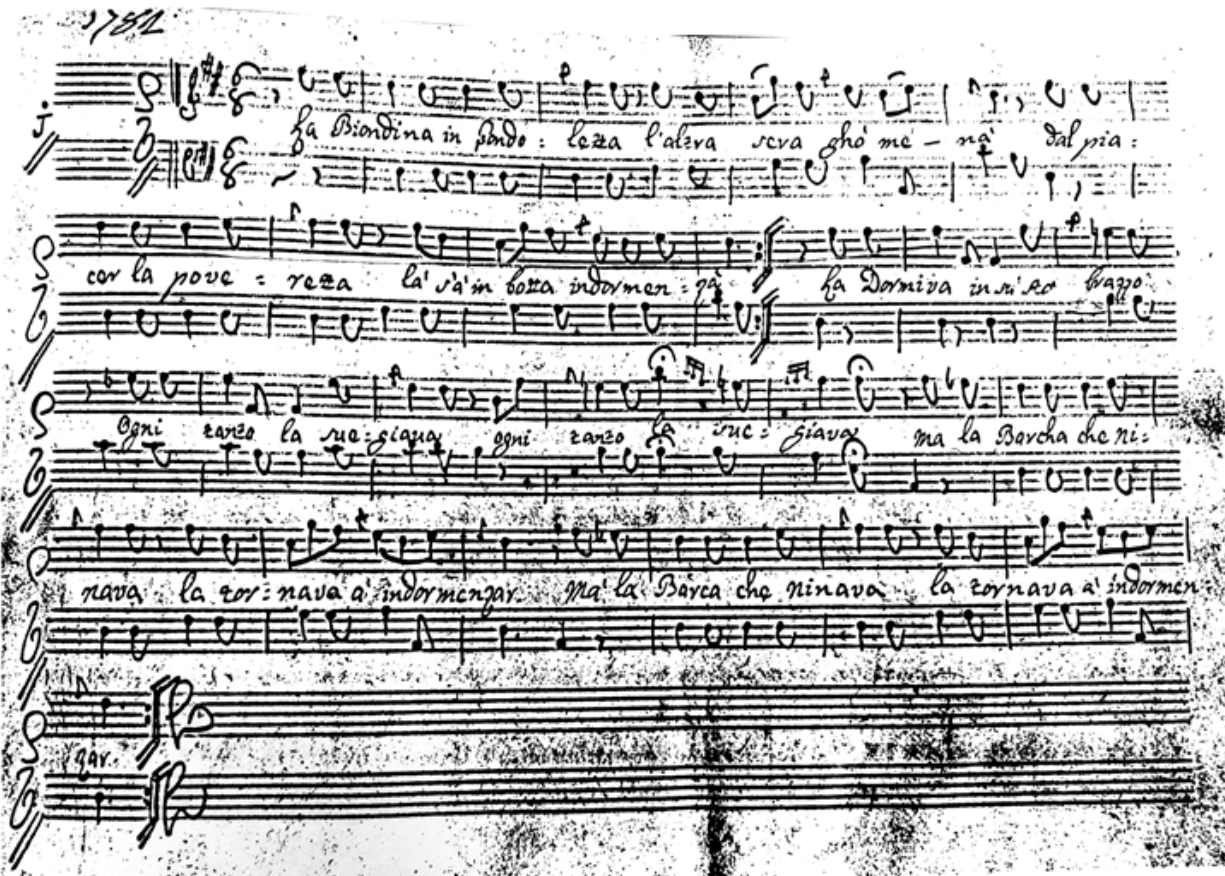
Example 1. Barcarolle titled “La Biondina in gondoleta” by Johann Simon Mayr (1763-1845).