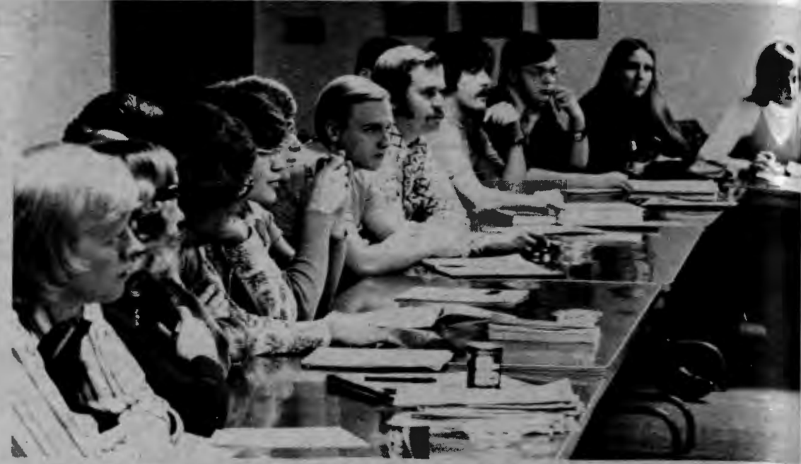
The newly elected Senators listen intently at last Sunday's Senate meeting, but did nothing more at they tabled all legislation introduced on the grounds they weren't well enough informed to act on the

equipment for research, and I feel the building would pay itself back in one year," Lingen remarked.