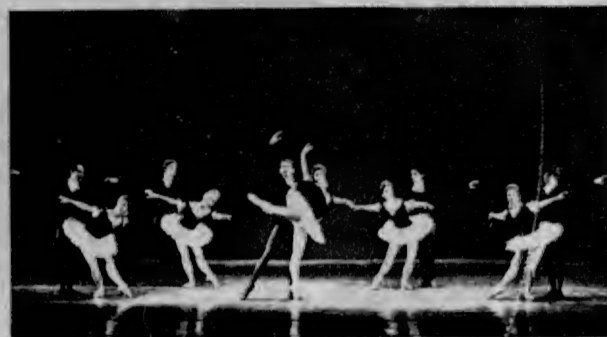
Monday, October 15, 1973 — 8:15 p.m.

The story is not a good-guy-gets-bad-guy type; there is a lot of emphasis on growing up and facing life.