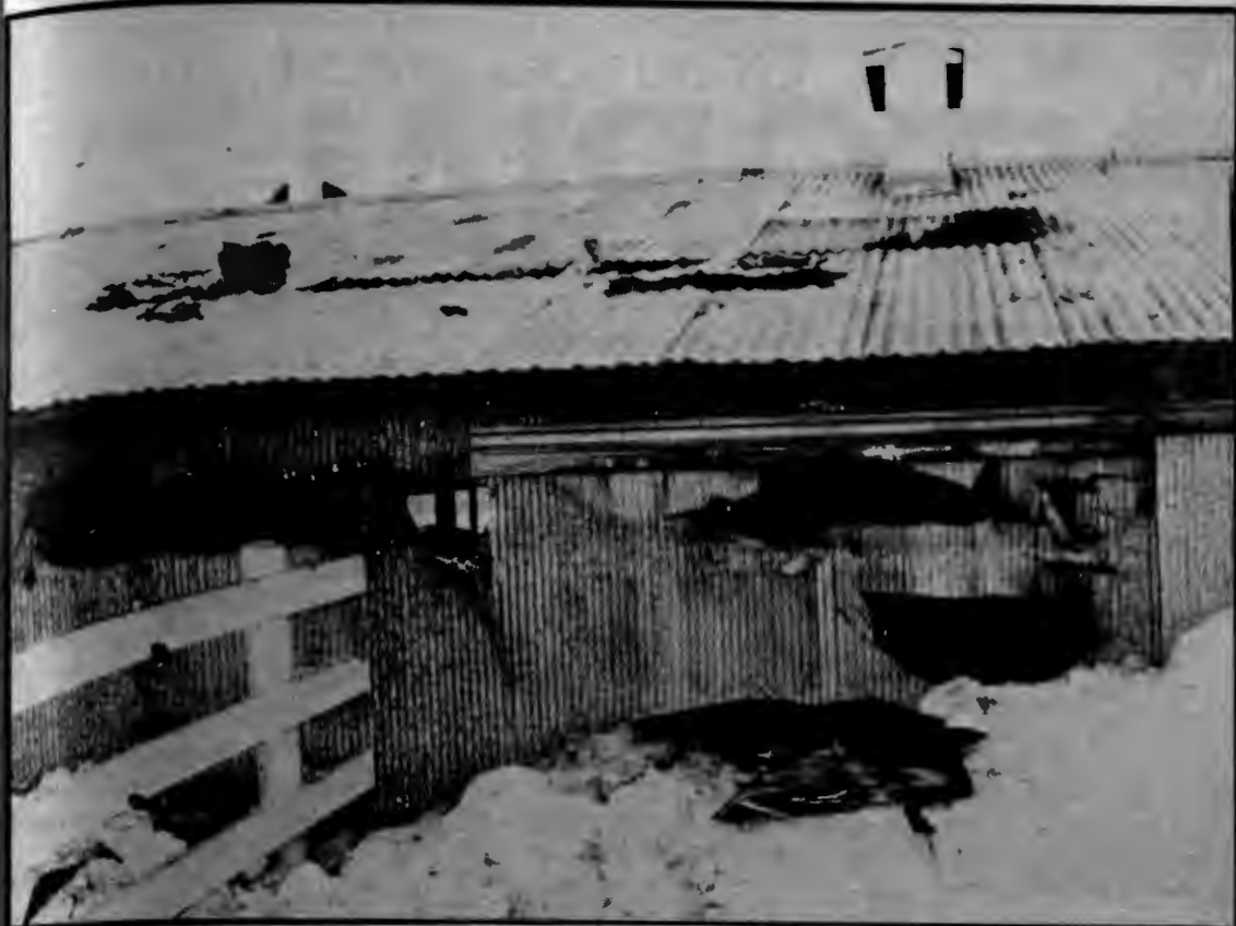
The exterior of the building had holes torn in it to give the firemen easy access to the blaze. They had the fire out within a half hour.