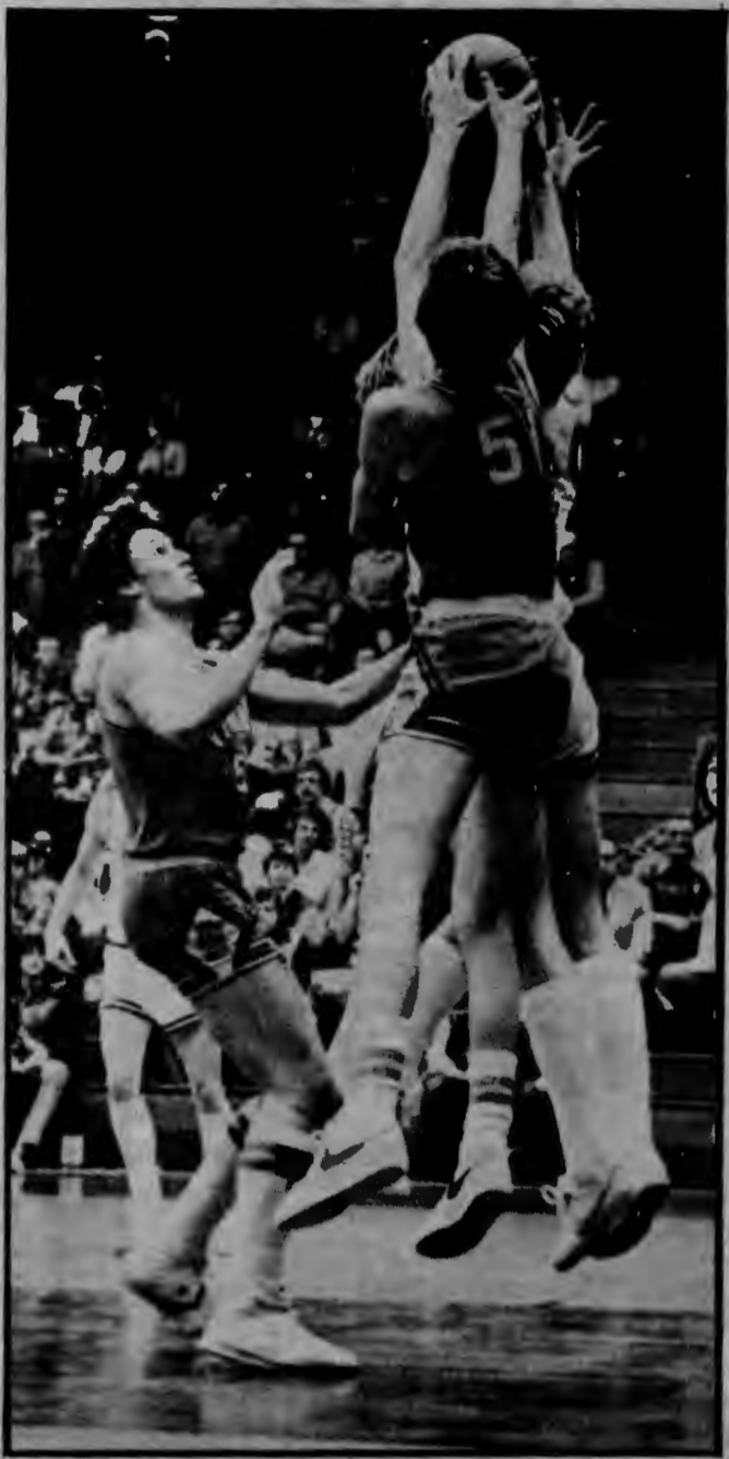
The Bison had ten fewer rebounds than the Vikings but came out on top at the end of the game 82-59.