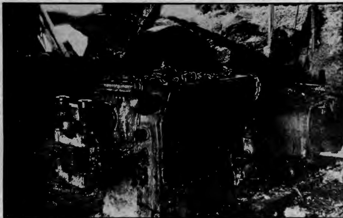
A machine used for extruding sunflower stalks came through the fire looking very black, but was otherwise undamaged.