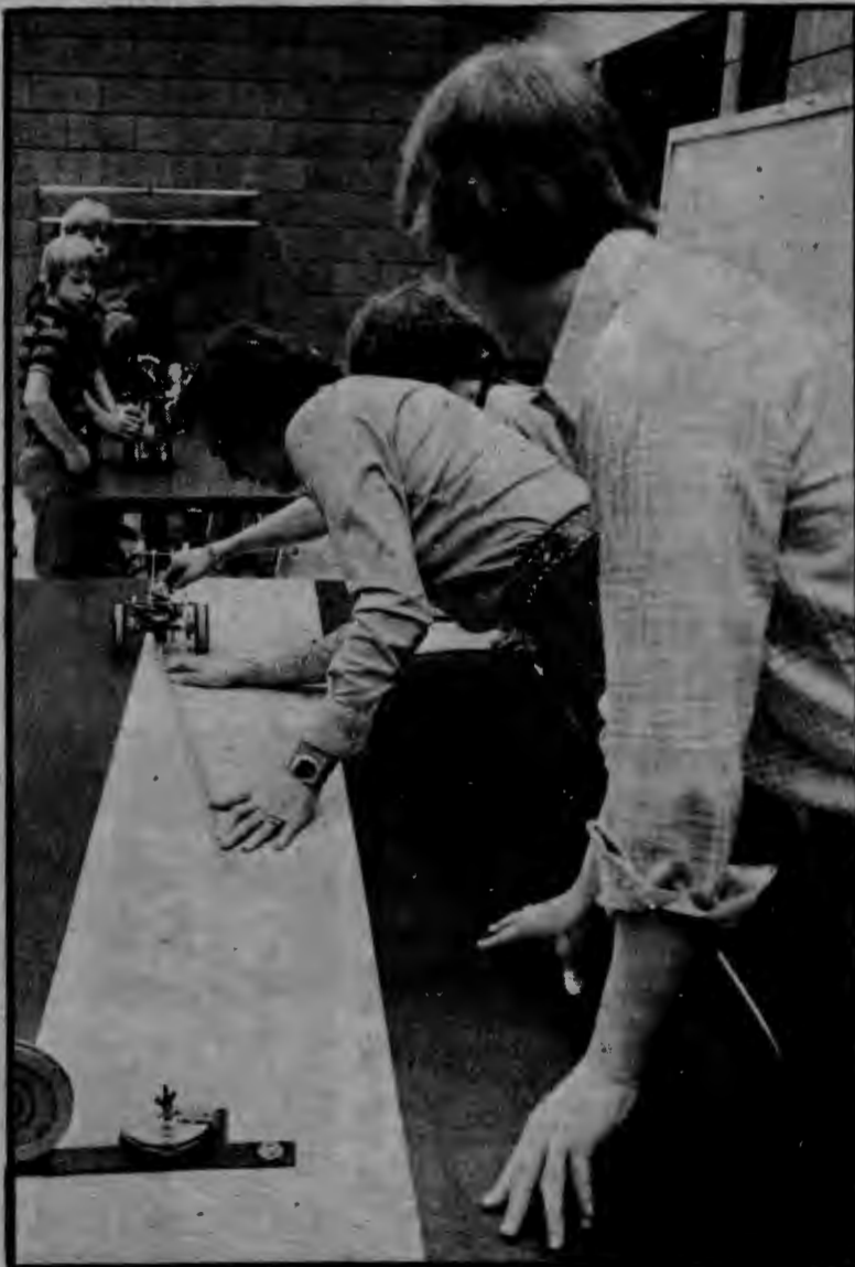
The model tractor performance contest was held at the same time as the Ag. Engineering show. This portion of the show was sponsored by the Agricultural