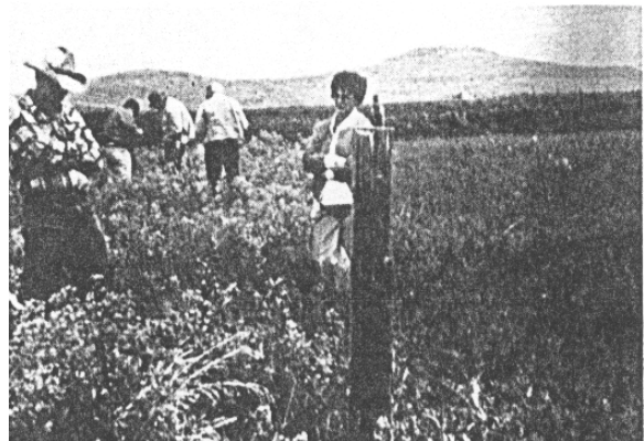
Ranchers observe the effects of cattle grazing (left) and sheep grazing (right) on leafy spurge.