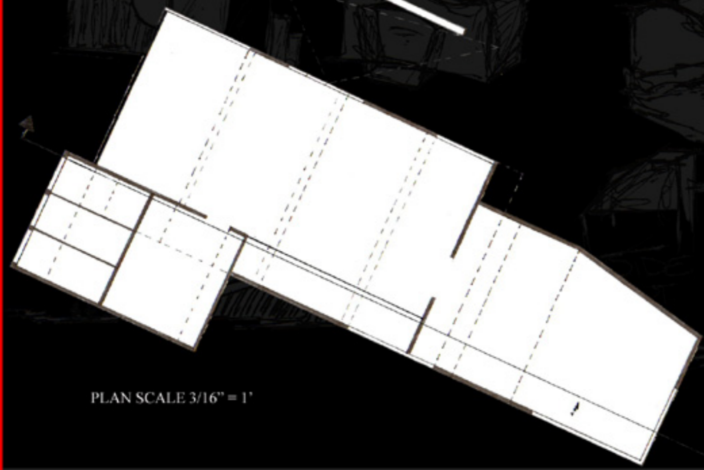
PLAN SCALE 3/16" = 1'