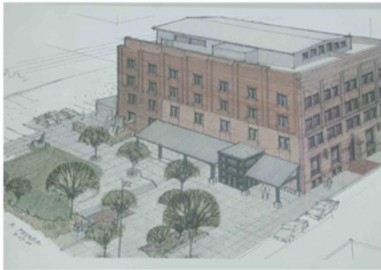
Sketch of the finished downtown project