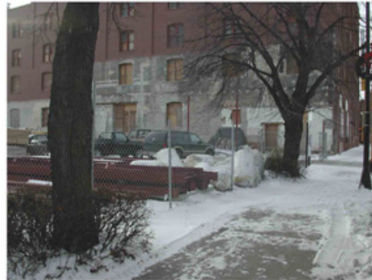
Site is inbetween trees