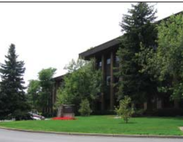
Transportation Safety Systems Center new location.