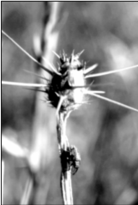
The weevil Eustenopus villosus has been introduced in the Pacific Northwest to reduce yellow starthistle populations.

Yellow starthistle ( Centaurea solstitialis ) is an annual weed, one that completes its life cycle in a single growing season. Seeds germinate anytime between October and June, depending on when rain occurs. 19 The plant then grows as a rosette with a robust tap root that can reach a depth of 6 feet by early summer. In May or June, the plant bolts, then flowers, and sets seed. 20