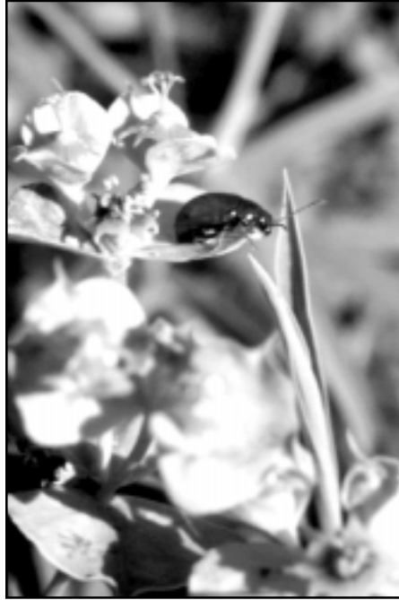
Aphthona flea beetles on leafy spurge. The beetles have been introduced as biological control agents of leafy spurge and have effectively reduced spurge populations on light well-drained soils.

spurge, the most promising natural enemies are the leafy spurge flea beetles. One beetle, Aphthona nigricutis , has given "excellent control" 10 in areas with lighter soils. In Alberta, Canada, leafy spurge was reduced 99 percent five years after release of the beetle. 10 In Manitoba, spurge was reduced 93 percent 7 years after release. 11 In Fremont County, Wyoming, over 50,000 square feet of leafy spurge was eliminated in the first four years after release. 12 On a Montana ranch, beetles provided 80 percent control of spurge over an area three miles long and a mile wide in six years. 9 A related species Aphthona cyparissiae , which prefers moister soils, has also been widely distributed. Researchers believe that these flea beetles "should solve the prairie leafy spurge problem on dry, light, open soils." 11 What is needed now are similarly effective natural enemies on wetter, heavier soils. Another related flea beetle, Aphthona czwalinae , has the potential to meet this need. 13