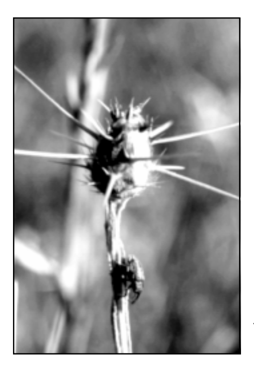
The weevil Eustenopus villosus has been introduced in the pacific Northwest to reduce yellow starthistle populations.

Yellow starthistle ( Centaurea solstitialis ) is an annual weed, one that completes its life cycle in a single growing season. Seeds germinate anytime between October and June, depending on when rain occurs.<sup>19</sup> The plant then grows as a rosette with a robust tap root that can reach a depth of 6 feet by early summer. In May or June, the plant bolts, then flowers, and sets seed.<sup>20</sup>