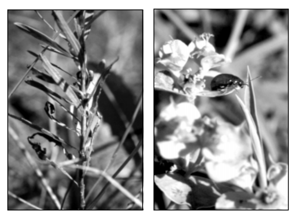
Aphthona flea beetles on leafy spurge. The beetles have been introduced as biological control agents of leafy spurge and have effectively reduced spurge populations on light well-drained soils.

produce a mature plant in one season.<sup>2</sup> Spurge seeds grow inside a capsule that bursts when the seed is ripe, dispersing seeds up to 15 feet.<sup>5</sup> The seeds can live for up to 7 years in the soil,<sup>5</sup> so that germination of new seedlings can occur long after visible plants are gone.