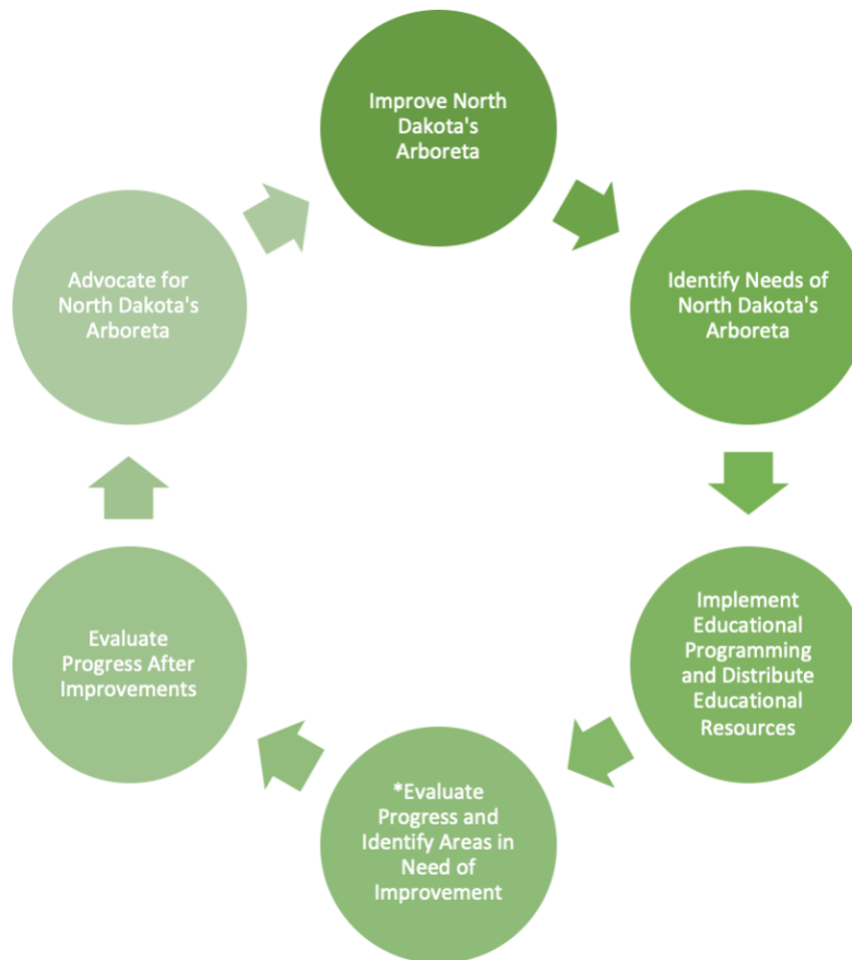
PDCA Model for Continuous Improvement

Note. This is where the Master’s project currently is in the cycle.