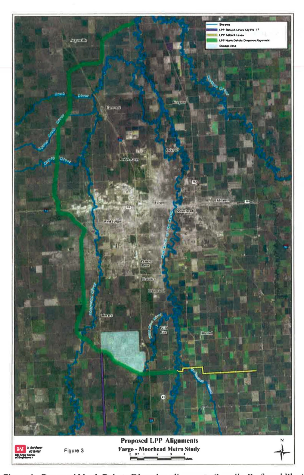
Figure 1. Proposed North Dakota Diversion alignments (Locally-Preferred Plan).