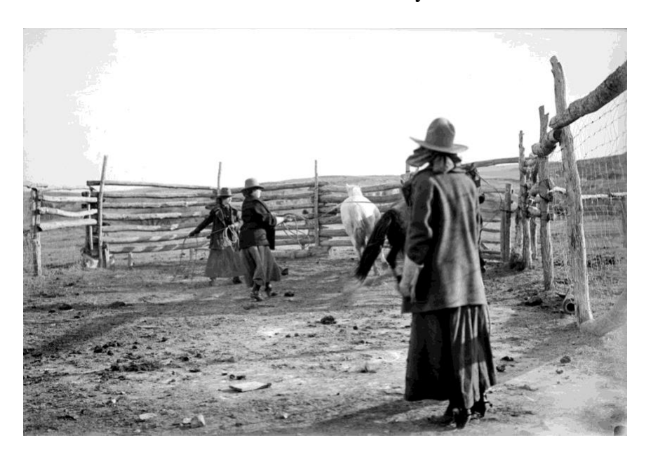
Figure 14. The Buckley sister roping horses 1909.

no concrete evidence to support these claims as fact aside from local stories and lore. However, it is important to mention here as it is evidence to the Buckley sisters skills. <sup>47</sup>