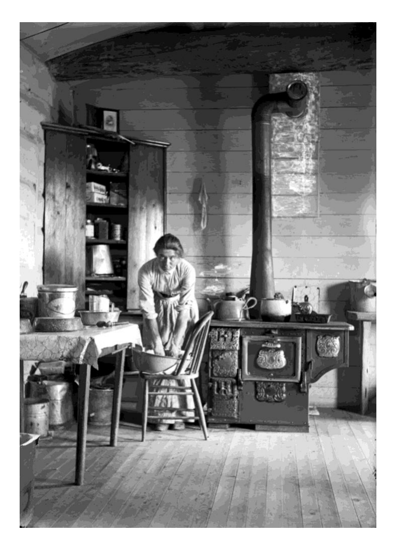
Figure 6. Evelyn Cameron self-portrait in her kitchen 1895. Evelyn Cameron, Montana Historical Society.

In comparison the photograph above dated 1895 shows Evelyn fulfilling domestic duties in her pristine kitchen, preparing bread. This photo is an example of the qualifying tasked located within the domestic sphere.