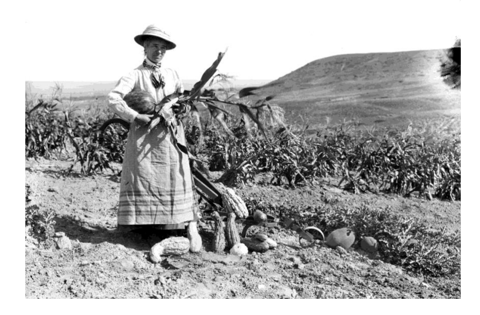
Figure 3. Evelyn Cameron Harvest 1906.