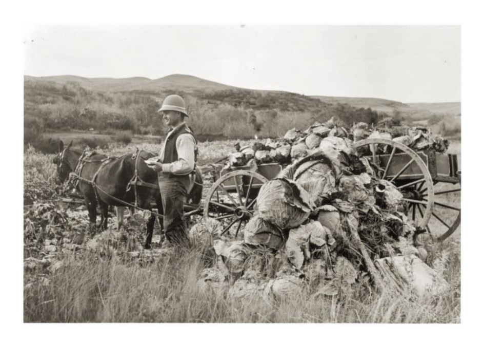
Figure 2. Alec Flower cabbage harvest 1898.