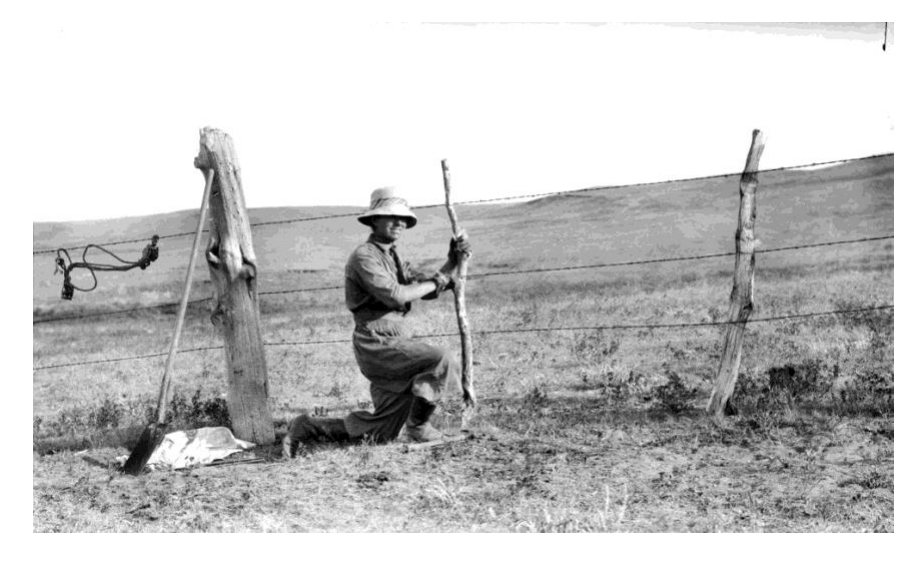
Figure 8. Evelyn Cameron repairing her fence line 1916.