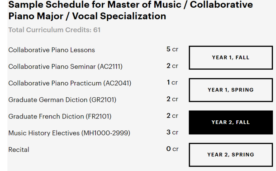
Figure 3-2. Sample of Collaborative Piano Program Coursework at the Manhattan School of Music

Conservatory may choose only one specialization. Similar to the United States, the Central Conservatory of Music uses a credit system for this program. To complete a master's degree, students are required to complete approximately fifty credits in three years. Excluding those courses that focus on political philosophy and theory, the coursework required for Central Conservatory of Music collaborative piano students is very similar to that required of collaborative piano students in the U.S. (Figure 3-2)<sup>89</sup> Figures 3, 4, and 5 lay out the typical coursework at the Central Conservatory of Music for each specialty depending upon student emphasis: