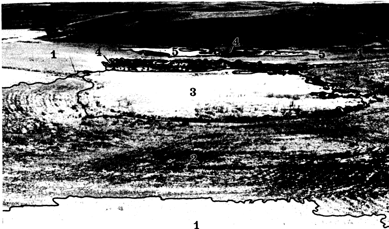
Figure 2. Photograph of an active saline seep in the spring. Area 1 is normal bare soil. Area 2 is dense growth resulting from high moisture. Area 3 is the dense growth of wild barley. Area 4 is kochia. Area 5 is bare soil with white salt crust. Some curled dock can be seen in Area 3. The seep is growing from area 5 towards Area 1 in the foreground.

Methods of control have been previously discussed in detail (Worcester et. al, 1975). Basically, the recommended approach to seep control has been to identify a recharge area, that portion of the landscape which is the source of excess water, and to remove this water by the use of deep rooted legumes, such as alfalfa, in the recharge area. Once the excess water is removed, intensive cropping should be implemented to reduce future accumulations of water below the root zone. Intensive cropping will require careful management of such moisture sources as snow. This may be trapped by standing stubble. It will also require application of proper fertilizer materials to maintain yield levels.