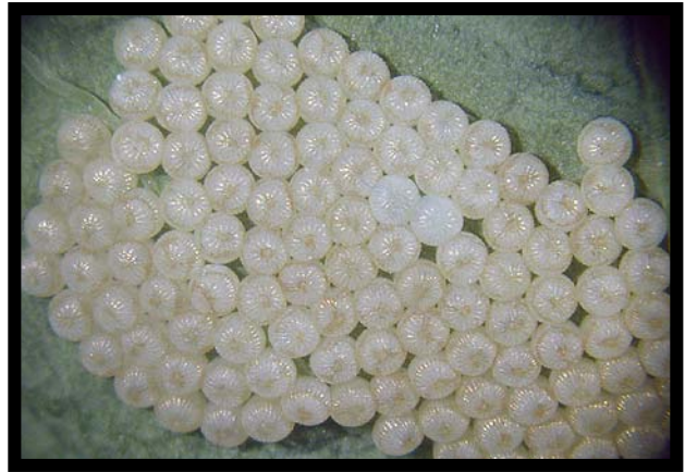
Figure 2. Bertha armyworm eggs. (Knodel, Department of Entomology, NDSU)

Larvae feed at night and often hide underneath leaf litter and clumps of soil during the day, which