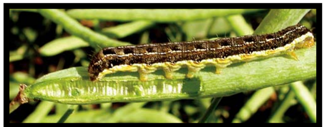
Figure 7. Mature larva feeding on pods.