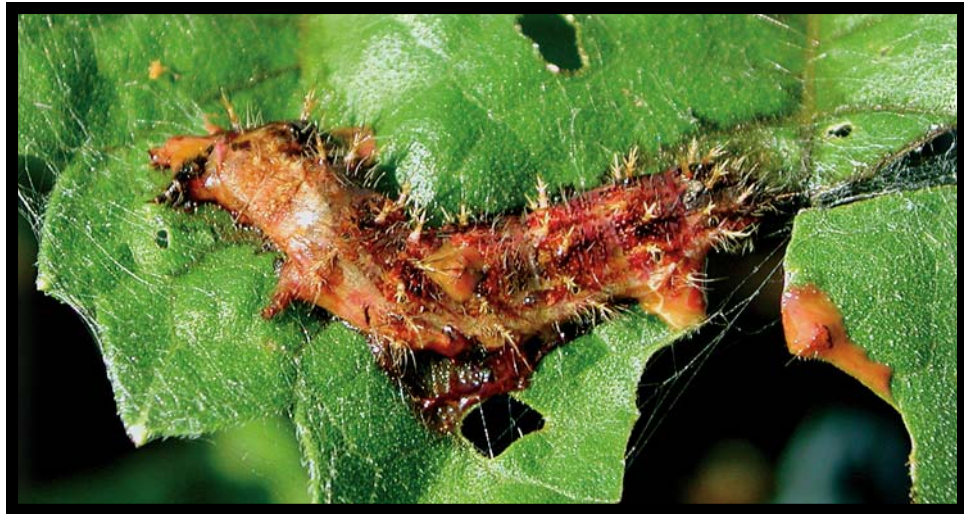
Figure 9. Example of Lepidopteran larva (thistle caterpillar) infected with nuclear polyhedrosis virus, a natural biological control agent. (Knodel, Department of Entomology, NDSU)

One of the most successful cultural control methods is early seeding of an early maturing variety. Yield loss from bertha armyworm can be minimized if canola flowers before the peak moth flight.