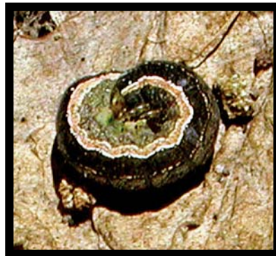
Figure 6. Larva curled into ball (a defensive behavior). (Knodel, Department of Entomology, NDSU)

Pupation usually begins in mid to late August and continues through early September. Pupae overwinter in the ground at depths of 2 to 6 inches (5 to 16 cm).