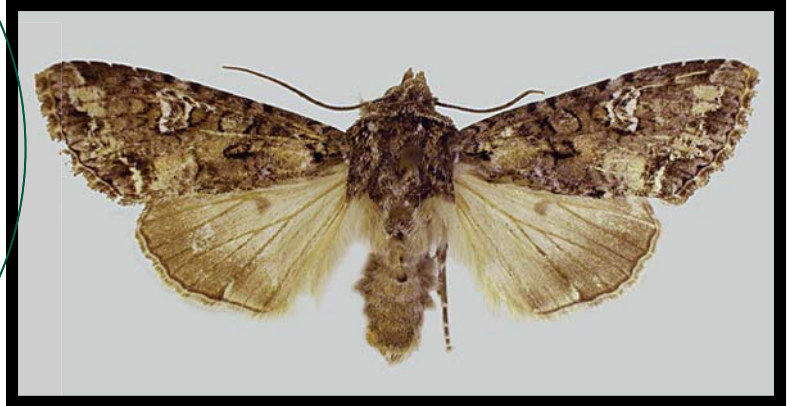
Figure 1. Bertha armyworm adult.