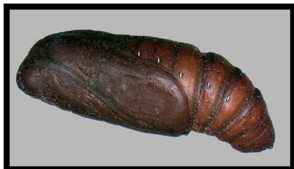
Figure 4. Bertha armyworm pupa.