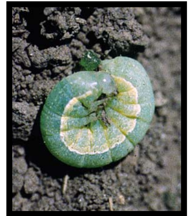
Figure 3. Green (top) and black (left) phases of mature bertha armyworm larvae.