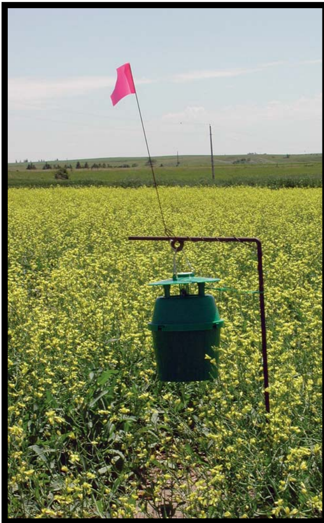
Figure 8. Sex pheromone trap used to monitor bertha armyworm.

Bertha armyworm is polyphagous and is known to feed on more than 40 plant species. A variety of crops and weeds serve as host plants for bertha armyworm. Canola, rapeseed, mustard, alfalfa and related plants are the preferred host plants. Flax, peas and potatoes serve as secondary host plants. Larvae also can feed on various weed species, including wild mustard, Canada thistle, sow thistle and lambsquarters.