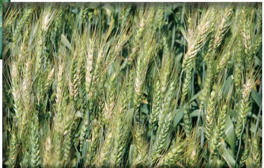
Figure 2. Susceptible hard red spring wheat line with numerous FHB infected grain heads.

In wheat and durum , any part or all of the head may appear bleached (Figure 1). These white heads are very conspicuous in a susceptible variety (Figure 2). The partly white and partly green heads are diagnostic for the disease in wheat. The fungus also may infect the stem (peduncle) immediately below the head, causing a