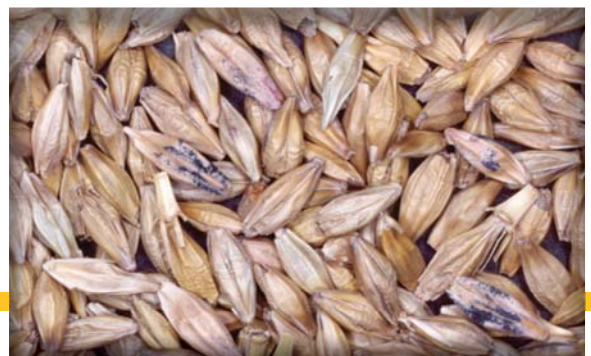
Figure 6. FHB infected barley kernels. Note pink discoloration caused by fungal infection and the blue-black structures which are the sexual stage spore-bearing bodies of the causal fungus.