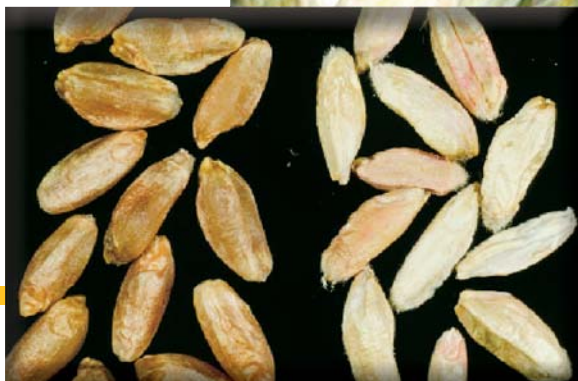
Figure 4. Healthy durum kernels (left) and FHB infected durum kernels (right). Note chalky white to pink discoloration of infected kernels.