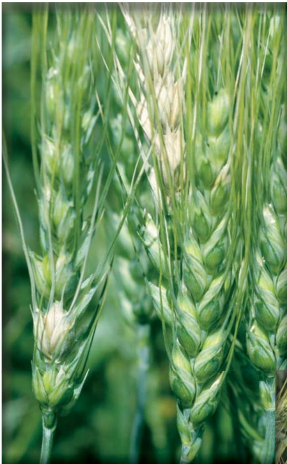
Figure 1. FHB infected wheat with wheat head showing bleached spikelets.

Stephen Neate, Barley Pathologist, Department of Plant Pathology