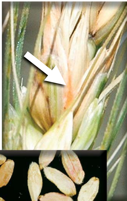
Figure 3. Salmon-orange spores of Fusarium graminearum visible on glumes of wheat.

In barley , infected spikelets may show a bleached appearance or a browning or water-soaked appearance (Figure 5A, 5B). Severely infected barley kernels at harvest may show a pinkish discoloration (Figure 6). Although rare, salmon-orange spore masses of the fungus can be seen on the infected spikelet and glumes in barley during prolonged wet weather.