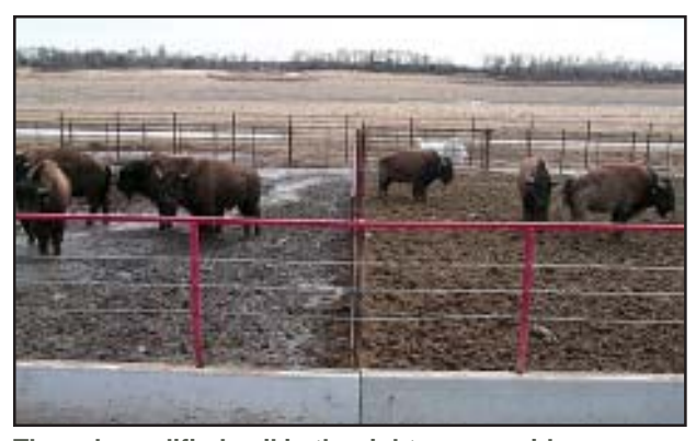
The ash-modified soil in the right pen provides improved drainage and stability, while wet, muddy conditions are evident in the untreated area (left).

Livestock production in the northern states is plagued by muddy, wet conditions during spring thaw and summer rainfall events. Animals in muddy feed yards have been observed to exhibit up to 30% reduction in growth rate and feed efficiency compared to animals in dry pens. Health challenges such as scours and pneumonia in young calves and foot rot in older animals can also be problematic in wet and muddy conditions. Stabilization with coal combustion fly ash can improve these conditions.