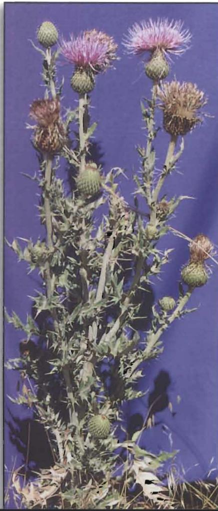
Figure 6A. Wavyleaf thistle is very pubescent and often gray, with leaves less divided than Flodman thistle.

Wavyleaf thistle is a perennial native plant that often is confused with Flodman thistle. Wavyleaf thistle tends to flower from July to September, which is a week or two earlier than Flodman thistle. Wavyleaf thistle tends to be more spiny and the leaves less deeply lobed than Flodman thistle (Figure 6A). Also, wavyleaf thistle is found in well-drained soils, generally in drier locations than Flodman thistle occupies. Wavyleaf thistle grows 3 to 4 feet tall and often is associated with sagebrush communities