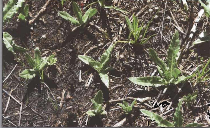
Figure 7B. One of the first plants to emerge following a burn is Canada thistle. Herbicide coverage is maximized and nontarget injury is minimized with this integrated control approach.

thistle response to fire has been erratic, with infestations sometimes reduced or occasionally enhanced by fire. However, ground litter is reduced, which results in uniform thistle regrowth and improved coverage with herbicides (Figure 7B). Herbicides applied to Canada thistle following a burn generally provide better long-term control, compared to treatments applied in very dense stands. Also, prescribed burns may stimulate growth of native species and discourage growth of invasive species, such as Canada thistle.