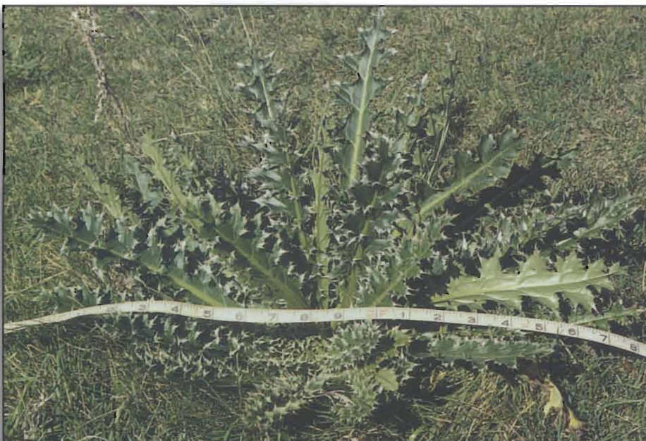
Figure 2B. Musk thistle rosette, which often grows 2 feet or more in diameter, with no pubescence on the underside of the leaf, which helps distinguish it from plumeless thistle rosettes.

are nearby in roadsides or pastures. Plumeless thistle can germinate in and tolerate a soil pH range from 3 to 9. Vesicular arbuscular mycorrhiza has been found on plumeless thistle in Europe. These organisms live symbiotically with the thistle roots and can help the plant with water and nutrient absorption. Well-established stands of plumeless thistle are self-renewing because other species provide little competition, and old stalks catch snow to insulate the rosettes and increase soil moisture for the next season's growth.