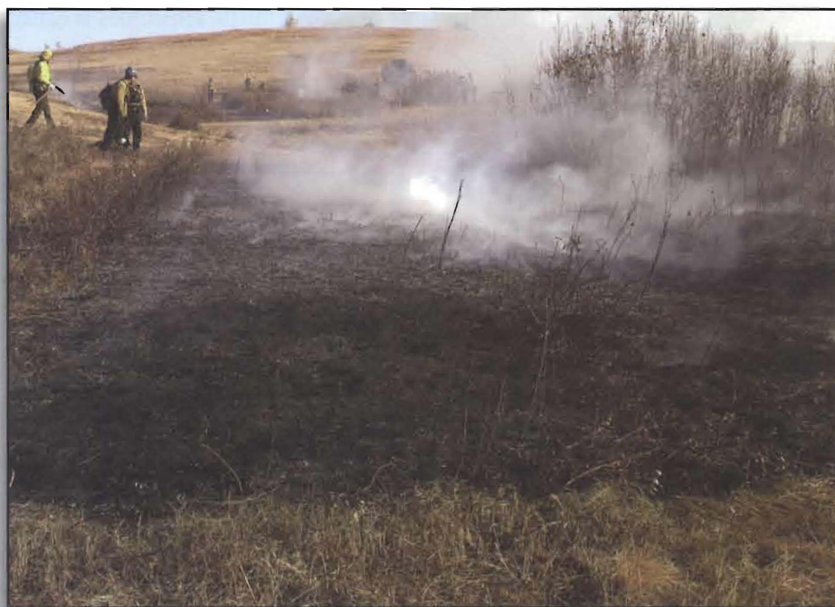
Figure 7A. Controlled burns can be used as part of an integrated program to control invasive weeds, such as Canada thistle.

Fire often is used for management of plant communities in North America, including management of invasive weeds such as Canada thistle (Figure 7). Canada