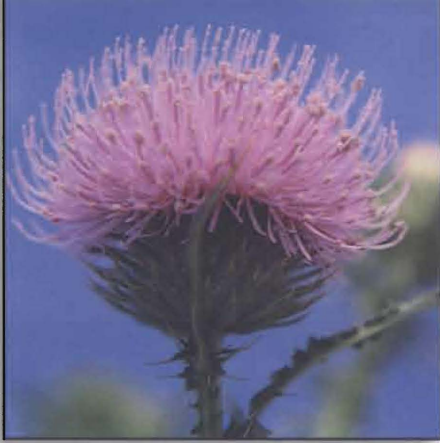
Figure 1B. Plumeless thistle flower with short, very sharp spines on the bracts.

are nearby in roadsides or pastures. Plumeless thistle can germinate in and tolerate a soil pH range from 3 to 9. Vesicular arbuscular mycorrhiza has been found on plumeless thistle in Europe. These organisms live symbiotically with the thistle roots and can help the plant with water and nutrient absorption. Well-established stands of plumeless thistle are self-renewing because other species provide little competition, and old stalks catch snow to insulate the rosettes and increase soil moisture for the next season's growth.