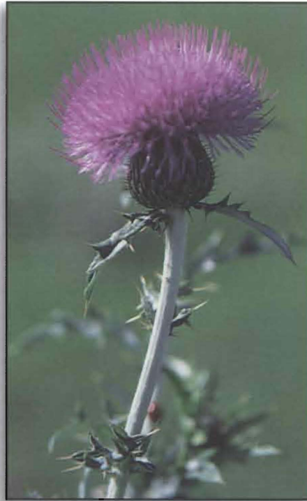
Figure 6B. Wavyleaf thistle flowers vary in color from lavender to pink, and stems are often white and very pubescent.

and rangeland, but is less common in moist meadows.