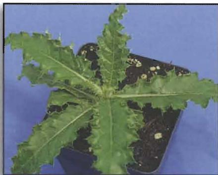
Figure 4B. Canada thistle rosette form with spiny tips and wavy leaves.

Both wavyleaf and Flodman thistle are native species that generally are only a problem when the land has been overused. Canada thistle was introduced from Europe, and like many introduced weeds, has spread rapidly because of the lack of natural enemies. All perennial noxious thistles are aggressive invaders and can become the dominant species in an area within a few seasons of introduction if not properly controlled.