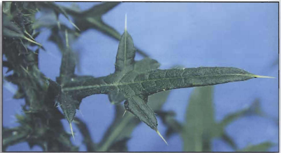
Figure 3A. Double dentate leaf with long, stiff spines at each tooth, prickly pubescence along the leaf midvein and winged stem, which is very pubescent during the rosette and early bolt growth stages of bull thistle.

The seeds germinate readily; however, seedling survival is low and bull thistle generally is found as single or scattered plants. The rosettes of bull thistle are very pubescent with dark purple ribs. The heads are gumdrop-shaped with long, stiff yellow-tipped spines. Bull thistle flowers from July to September, which is somewhat later than other thistles in the region. The flowers usually are purple, but a rare white flowering variety has been collected in the region.