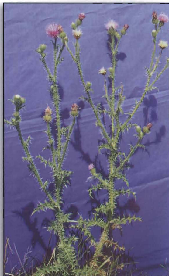
Figure 1A. Candelabra appearance of plumeless thistles showing spiny, winged stems.

Plumeless thistle seldom is found in cultivated fields, even when infestations