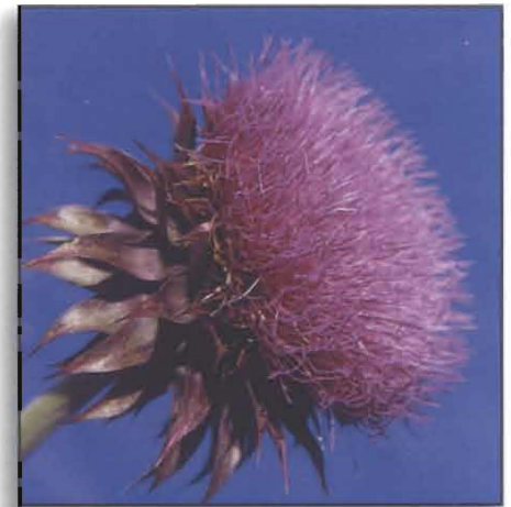
Figure 2A. Musk thistle flower with large brown bracts and the tendency to nod or lean because of the large size of the flower.

Musk thistle is one of the more common biennial noxious thistles and is relatively easy to identify because it often grows in excess of 6 feet tall, has very large flowers that tend to droop, and the flower has very characteristic brown bracts that resemble pine cones (Figure 2A). The flowers usually are deep rose, solitary and very large, ranging from 1.5 to 3 inches in diameter. The average musk thistle plant produces in excess of 10,000 seeds per plant, and under favorable conditions may produce 120,000 seeds per plant. Seed germination generally averages 30 percent. Rosettes are dark green with a light green midrib and often grow 2 feet or more in diameter (Figure 2B). Rosette leaves usually are smooth and lacking pubescence.