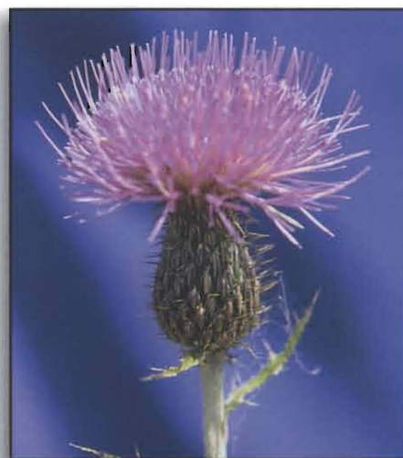
Figure 5B. Flodman thistle flower has a sticky secretion on the oval-shaped heads, which often attracts and catches insects.

The leaves of Flodman thistle are shiny green on