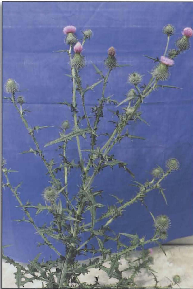
Figure 3B. Bushy appearance of bull thistle with spiny, conical shaped flower heads.