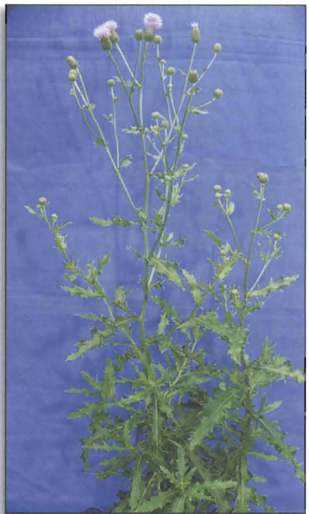
Figure 4A. Bolted Canada thistle with cluster flowers and waxy, wavy leaves.

Canada thistle usually grows 2 to 3 feet tall and bears alternate, dark green leaves that vary in size (Figure 4A). The leaves are oblong, usually deeply cut, and have spiny, toothed edges. Canada thistle has small (3/4-inch diameter), compact flower heads that appear on the upper stems and range in color from lavender to pink or white.