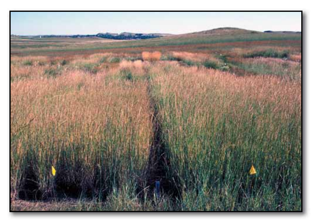
Visual differences between two intermediate wheatgrass varieties at the Hettinger plot.

July 31, 1996; and July 30, 1997, at Hettinger and Aug. 1, 1995, at Fort Pierre, with a rating of 1 for excellent, 5 for fair and 9 for poor. Herbage production was clipped annually for five consecutive years with a forage harvester at each study site in July and August (USDA NRCS 1997). All samples were weighed with subsamples collected and oven dried at 140 F for 48 hours. Subsamples were weighed to the nearest 0.1 gram and converted to lb/ac.