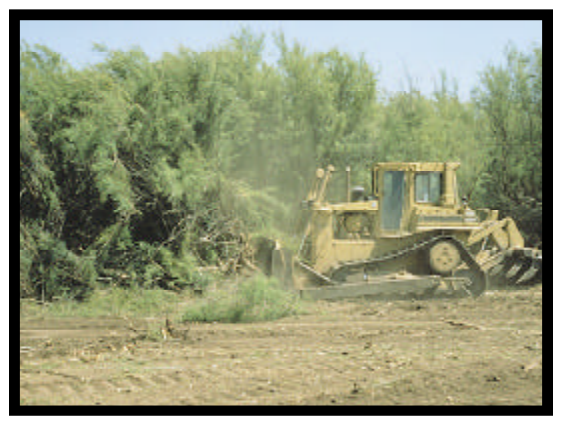
Figure 4. Saltcedar displaces native plants and wildlife.

dried up entire lakes (Figure 4). Native riparian species are quickly displaced by saltcedar, which in turn causes displacement of native birds and animals that generally do not feed on the leaves or eat the saltcedar seeds. Saltcedar, even in the seedling stage, will tolerate short-term flooding and can establish away from waterways when seeds are washed in during flooding. Once established the plants can become so thick cattle will not graze the area.