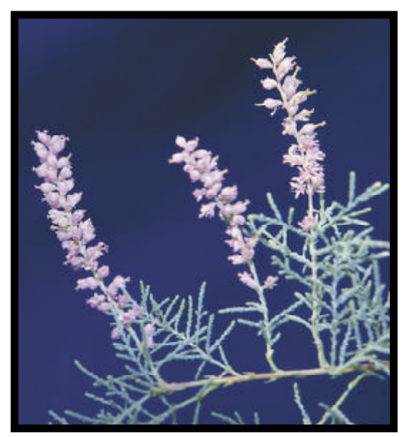
Figure 2. Saltcedar leaves and flowers.