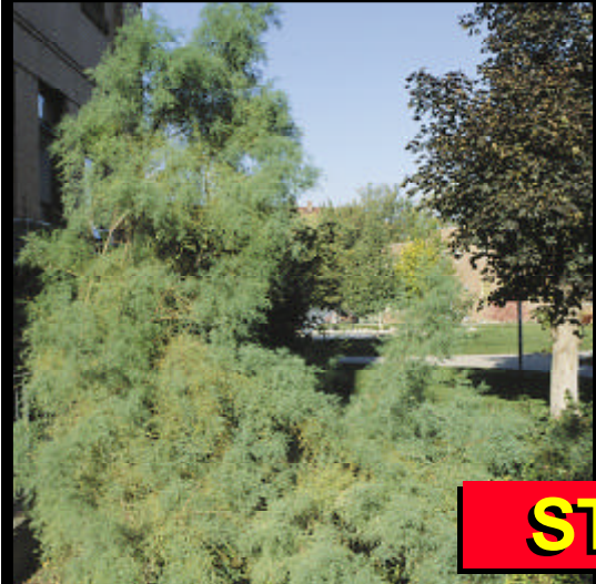
Figure 1. Saltcedar.