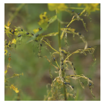
Figure 7. The larger the initial release number of adult Aphthona flea beetles, the more likely the population will establish and begin to control leafy spurge.

Grazing by sheep or goats after mid-August can increase leafy spurge control with Aphthona flea beetles. Grazing removes excess trash from the soil surface, providing a more suitable environment for egg and larvae survival. Fire may also be used to reduce cover, but avoid using a controlled burn until after mid-August when egg laying has been completed.