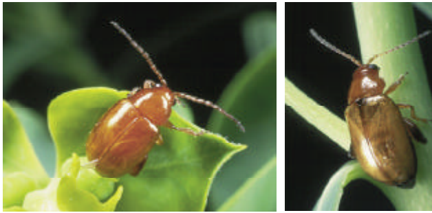
Figure 1. Aphthona species flea beetles are about the size of flax seed (about 0.10 inches long) and vary in color and shape depending on species. Shown are A. flava (copper to gold in color), A. nigriscutis (brown with a black dot) and A. lacertosa (black with brown femurs).

Denise L. Olson Assistant Professor Entomology Dept.