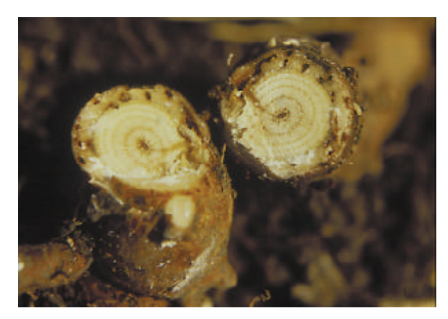
Figure 3. Larvae and holes from feeding damage in a leafy spurge root crown (top), and two larvae feeding in a leafy spurge root bud (right).