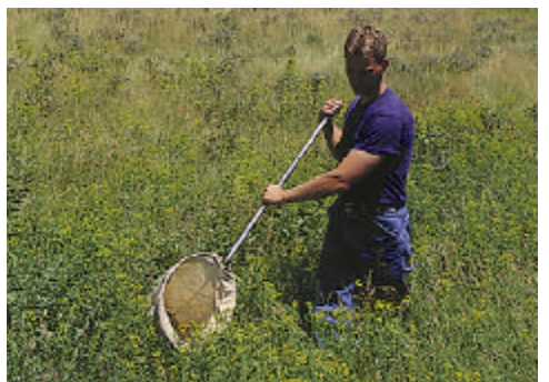
Figure 5. Sweep for Aphthona flea beetles on warm sunny days. The sweeping motion should be in an arc from left to right over the top two thirds of the leafy spurge plant. Avoid hitting rocks and soil.