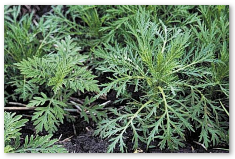
Figure 6. Comparison of biennial wormwood (right) and common ragweed (left) plants growing next to each other in the field.

Seedling emergence can occur during the entire crop growing season under moist conditions and favorable environmental conditions. Characterization of emergence patterns in eastern North Dakota indicated that the weed began to emerge in late June or early July in corn, dry bean, soybean and sunflower (Kegode and Ciernia 2003). Biennial wormwood grows slowly after emergence, remaining as a rosette until midsummer, when plants bolt and growth becomes rapid. Biennial wormwood often is confused for common ragweed (Figure 6).