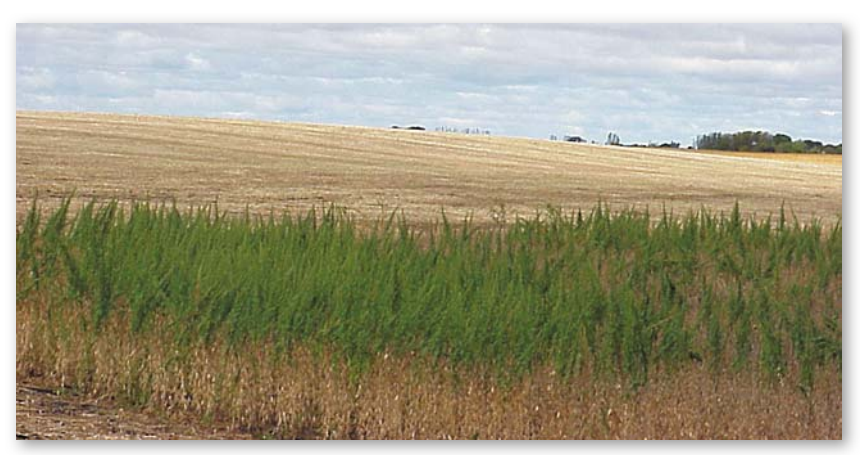
Figure 9. Unharvested section of a soybean field due to a biennial wormwood infestation.

Upon emergence, biennial wormwood seedlings grow slowly and occur as rosettes for much of the early part of the growing season (Mahoney and Kegode 2004). In late July, when day length is declining, biennial wormwood plants bolt as they prepare to reproduce and appear above the canopy of crops such as soybean (Figures 4 and 9).