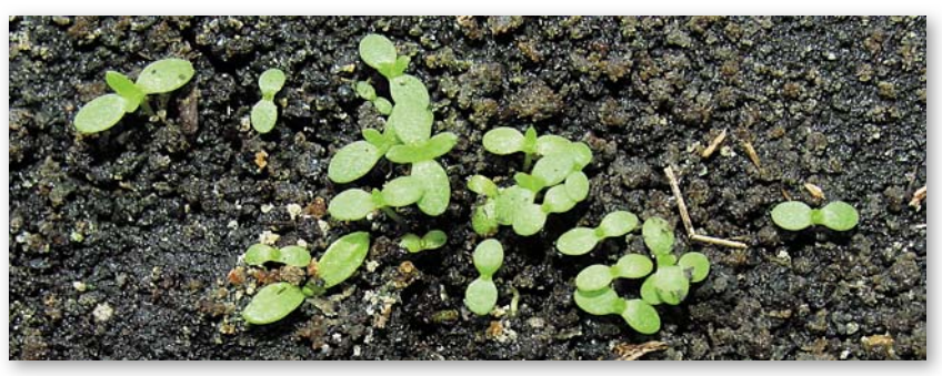
Figure 1. Biennial wormwood seedlings approximately seven days after emergence.

Biennial wormwood is an aggressive and prolific seed-producing plant that has become a problem mainly in soybean and dry edible bean production areas of Minnesota, North Dakota and South Dakota. Biennial wormwood, as its name infers, was primarily biennial when the species first was classified, but weedy cropland biotypes of biennial wormwood are annual plants. Many factors, such as season-long emergence, prevalence in moist environments, adaptation to all tillage systems, tolerance to commonly used soil-applied and postemergence herbicides, and misidentification of biennial wormwood as common ragweed, contribute to increased biennial wormwood infestations. Some herbicides used to control common ragweed do not control biennial wormwood.