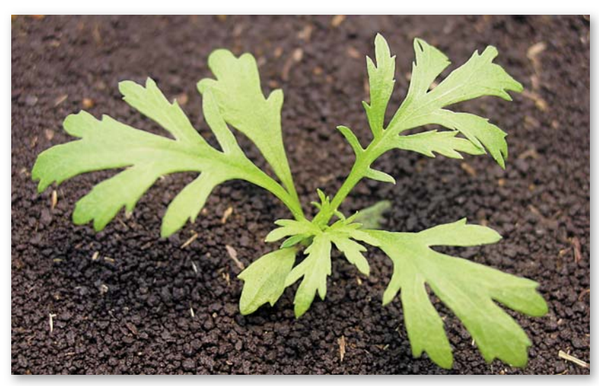
Figure 2. Biennial wormwood seedling approximately three to four weeks after emergence.