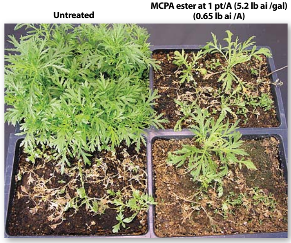
Figure 13. Control of biennial wormwood with MCPA ester, 2,4-D amine and 2,4-D ester.

2,4-D amine at 1 pt/A (3.8 lb ai /gal) 2,4-D ester at 0.75 pt/A (5 lb ai /gal) (0.48 lb ai /A) (0.47 lb ai /A)