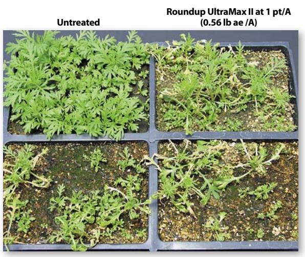
Roundup UltraMax II at 1.5 pt/A (0.84 lb ae /A)