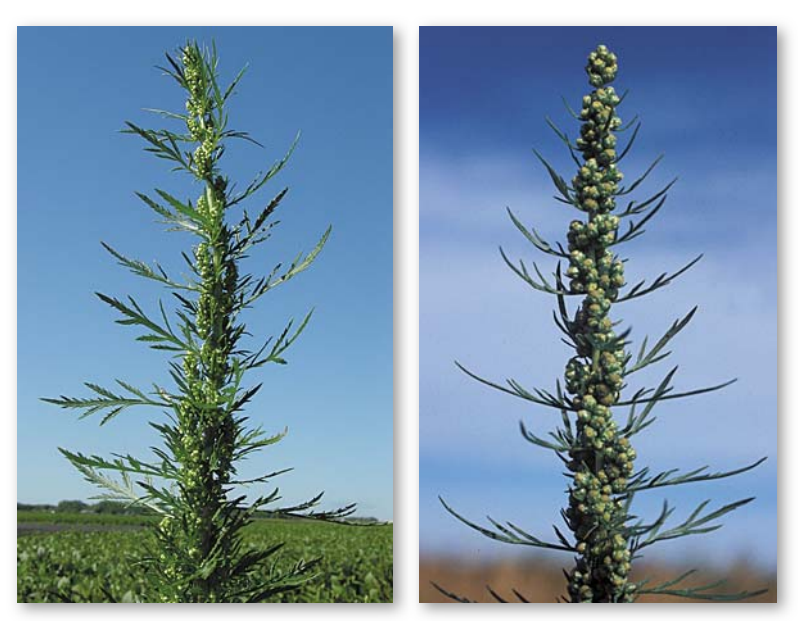
Figure 4. Photo showing spikelike flower head of a mature biennial wormwood plant in early September (left) and mid-October (right) at Fargo, N.D.