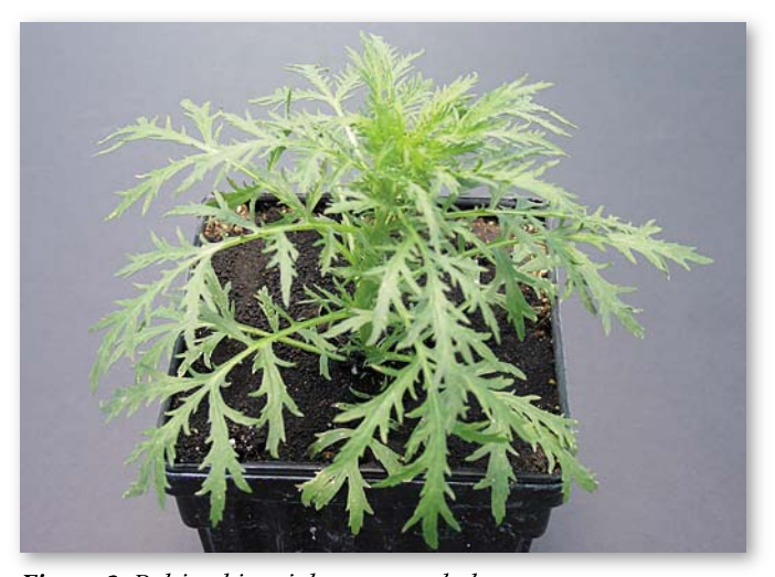
Figure 3. Bolting biennial wormwood plant.

Biennial wormwood is a small-seeded plant that behaves like an annual species. Biennial wormwood stems arise from a tap root, are hairless and often are tinged red. The leaves are hairless and have toothed margins. Plants typically grow 3 to 7 feet (1 to 2 meters) tall with a woody stem averaging 1 to 2 inches (3 to 5 centimeters) in diameter. Biennial wormwood flowers consist of heads in clusters arranged in a spikelike form. Biennial wormwood is a prolific weed, producing approximately 1 million seeds per plant (Stevens 1932). Mahoney and Kegode (2004) later estimated that a single biennial wormwood plant produced 400,000 seeds. Stevens' estimate of seed production possibly was from a biennial plant, whereas the later estimate was from an annual plant.