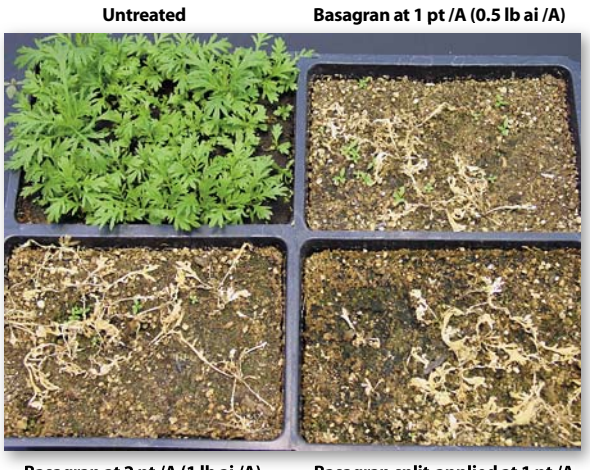
Basagran at 2 pt /A (1 lb ai /A)

Biennial wormwood can go undetected in crop fields until the seedlings are too large to be controlled effectively. Evaluation of Basagran®, Liberty® and glyphosate in greenhouse studies for efficacy of control of various sizes