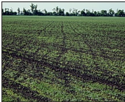
Figure 1. Spring wheat seedling damage from a fall anhydrous ammonia application in high carbonate soils.

to seeding. Manure rates should be modest, as predicting the actual nitrogen availability from the manure is difficult.